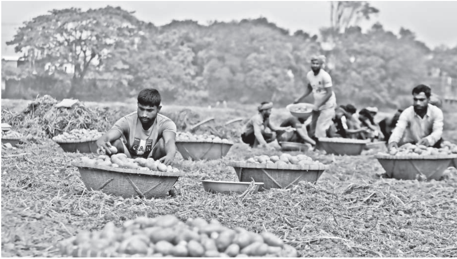
Farmers collect potatoes from a field after a bountiful harvest this season as they head home to sell their produce in local markets. The photo was taken in Sirajdikhan, Munshiganj recently.

Locals rushed him to Jamalpur General Hospital, where the on-duty physician declared him dead.