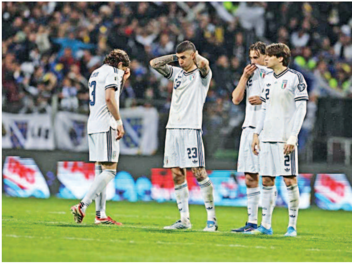
The roadmap for the 2026 FIFA World Cup -- the biggest yet, with 48 nations -- took shape yesterday against a backdrop of tears, joy, and historic feats. [Anti-clockwise] For Italy, it was shock and disbelief as Gennaro Gattuso's men suffered an agonising 4-1 penalty shootout defeat to Bosnia and Herzegovina in their playoff final, following a 1-1 draw in Zenica. The result means Italy -- reduced to 10 men after defender Alessandro Bastoni was sent off late in the first half -- will miss a third straight World Cup while Bosnia return to the event for the first time since 2014. Meanwhile, the Democratic Republic of Congo defeated Jamaica 1-0 at home with an extra-time winner from former England Under-21 international Axel Tuanzebe in their inter-confederation playoff final, securing their first World Cup appearance in 52 years, when the country was known as Zaire. In Mexico's Monterrey, Iraq players celebrated their return to the quadrennial event after a 40-year absence by claiming the final spot with a 2-1 win over Bolivia. Turkiye also returned after a 22-year gap, while Sweden (first time since 2018) and Czechia (first time since 2006) also booked their places in the tournament.