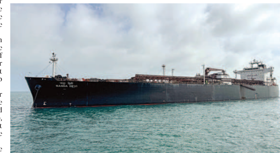
Indian vessel 'Nanda Devi' carrying liquefied petroleum gas arrives at Vadinar Port in the Jamnagar district of Gujarat state on March 17, after Iran allowed it to pass through the Strait of Hormuz.

For a big Suezmax-class crude carrier, the average "earnings" – a standard indirect indicator of charter costs – has more than tripled since February 26 to over $330,000 a day, according to maritime research group Clarksons.