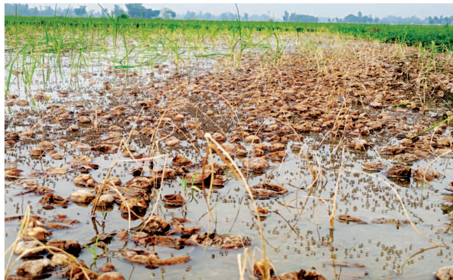
After potatoes were destroyed by stagnant rainwater, farmers of Shibganj upazila in Bogura and neighbouring Kalai upazila in Joypurhat faced a double whammy. They planted paddy over the unharvested potatoes, but the new crop has also failed. This photo was taken in Shibganj yesterday.

Eurovision, which started in 1956, is a famously eccentric festival in which artists from dozens of countries battle for the annual musical crown. It has long been centred in Europe, although in recent years it has begun to welcome participants outside the continent.