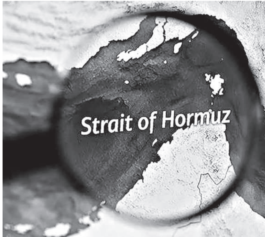
A map showing the Strait of Hormuz is seen in this illustration taken on March 23, 2026.

Over three million Bangladeshis work across Gulf states, sending home remittance that acts as a lifeline for millions of families and a critical pillar for our foreign exchange reserve. Prolonged instability in the region threatens workers' safety and the economic viability of the communities that depend on them. History shows that when Gulf economies contract, Bangladeshi workers are among the first to bear the burden through reduced wages, job losses, and forced returns.