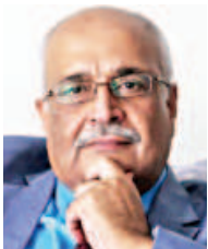
SEE PAGE 8 COL 3

"These legal ambiguities make a formal US waiver a prerequisite for cheaper Russian oil, directly constraining multilateral trade