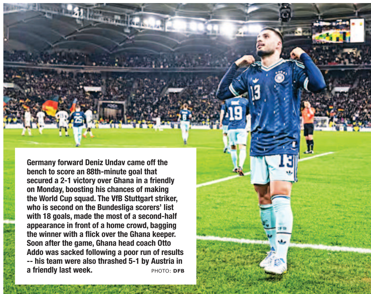
Germany forward Deniz Undav came off the bench to score an 88th-minute goal that secured a 2-1 victory over Ghana in a friendly on Monday, boosting his chances of making the World Cup squad. The VfB Stuttgart striker, who is second on the Bundesliga scorers' list with 18 goals, made the most of a second-half appearance in front of a home crowd, bagging the winner with a flick over the Ghana keeper. Soon after the game, Ghana head coach Otto Addo was sacked following a poor run of results -- his team were also thrashed 5-1 by Austria in a friendly last week.

**Visit The Daily Star website to also read "16 yellows, 4 reds: The chaos of the iconic 'Battle of Nuremberg'".