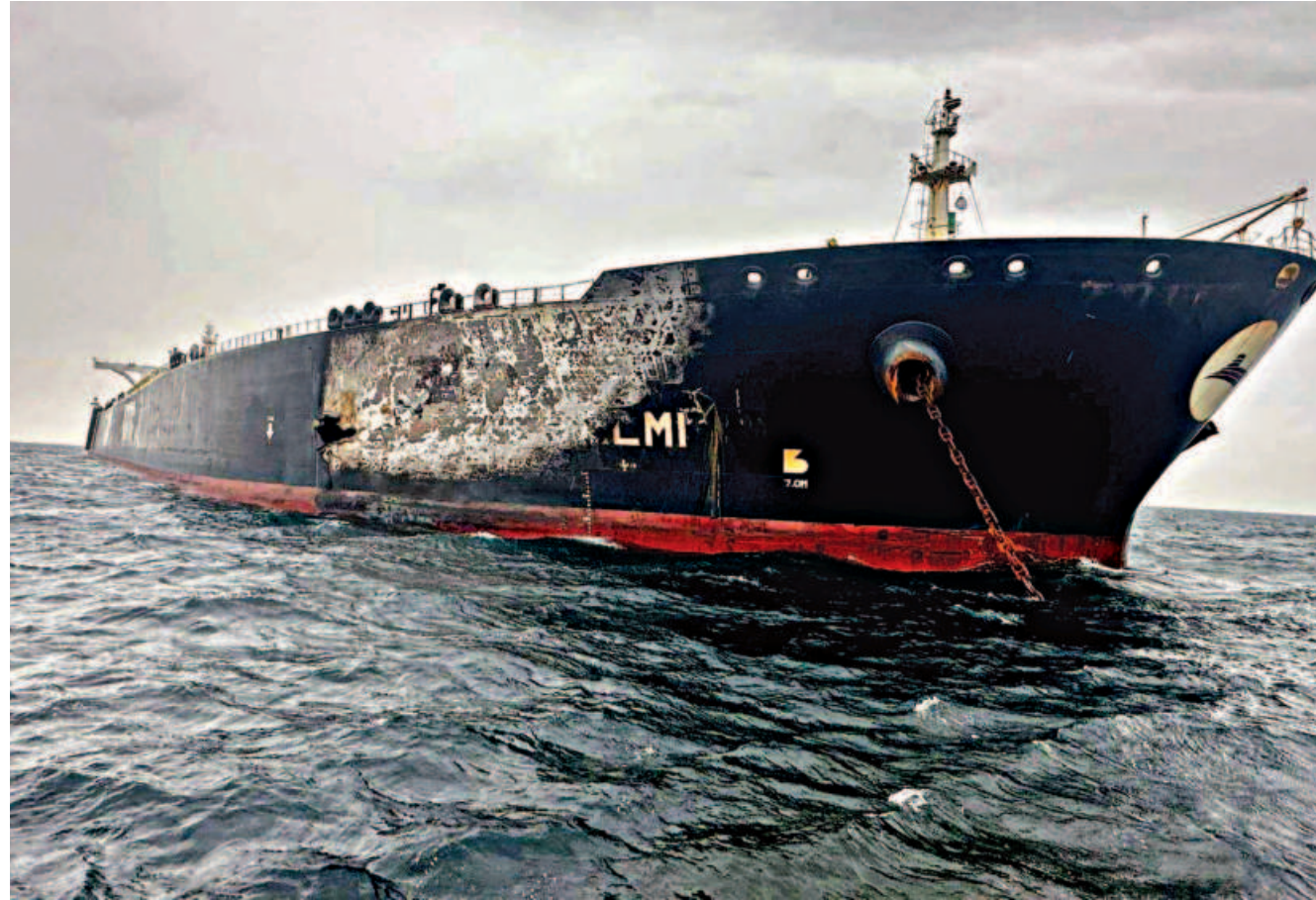
The Kuwait-flagged Al-Salmi crude oil tanker shows damage after a reported strike amid US-Israeli tensions with Iran, yesterday. Dubai authorities said the blaze on the tanker was contained, with no oil leakage or injuries.