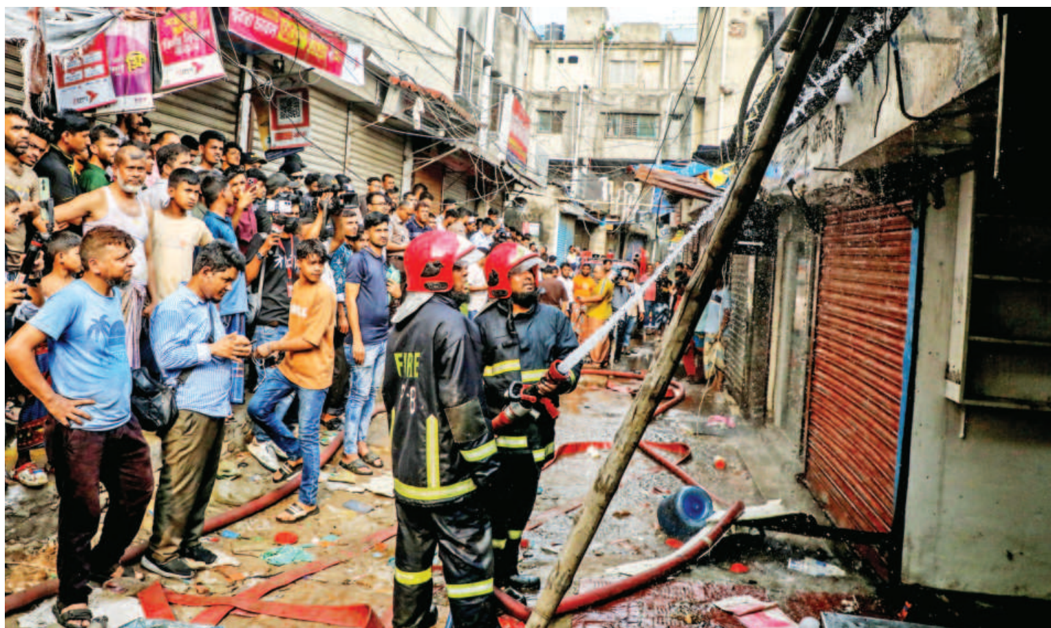
Firefighters extinguish a blaze triggered by a gas cylinder explosion at a restaurant on Nasirullah Road in the capital's Hatirpool area around 2:30pm yesterday. No casualties were reported.