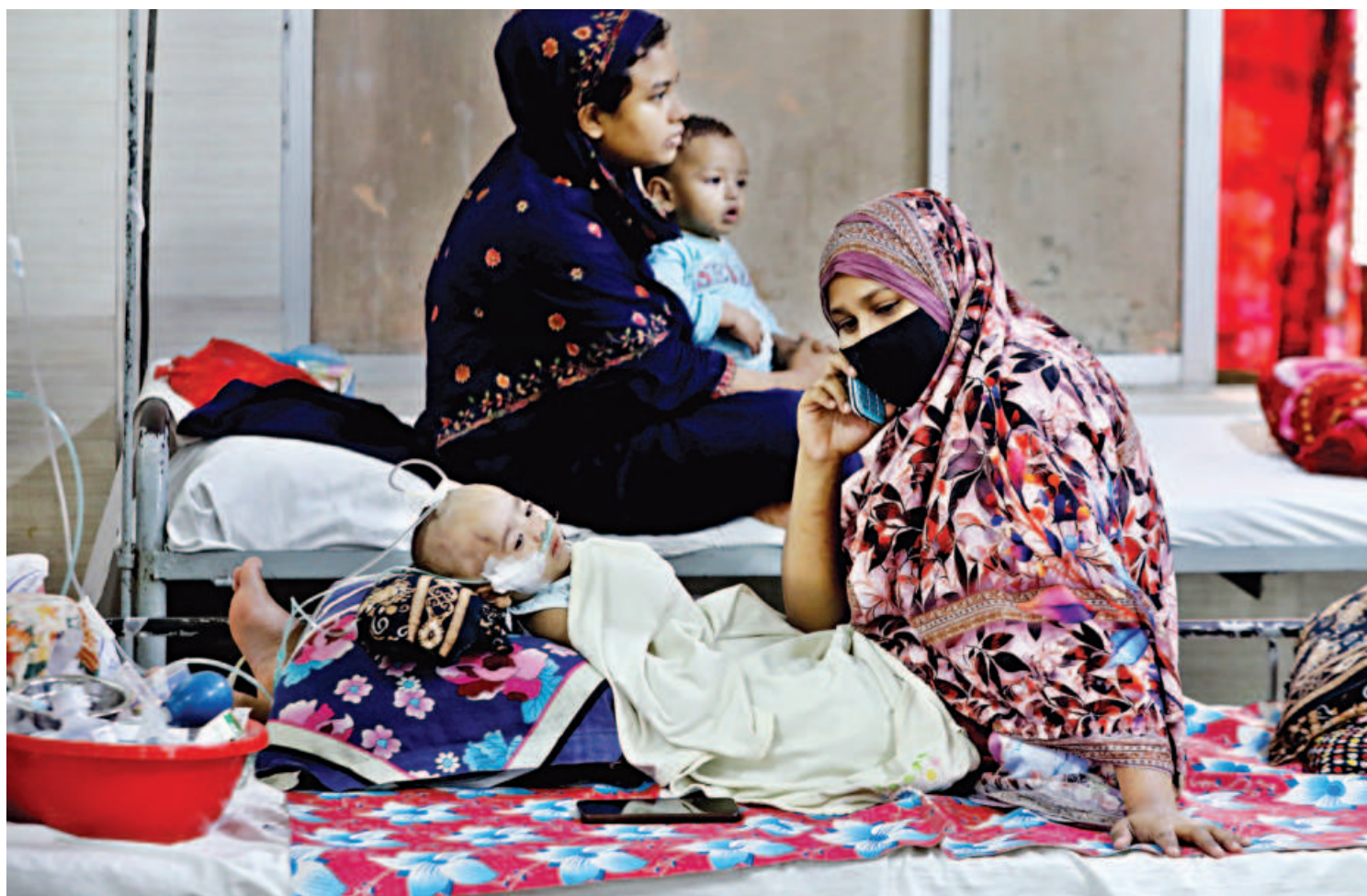
Mothers tend to children infected with measles at Bangladesh Shishu Hospital and Institute in the capital's Sher-e-Bangla Nagar yesterday. The hospital has opened a separate ward for measles patients amid an outbreak that has claimed the lives of at least 44 children so far.