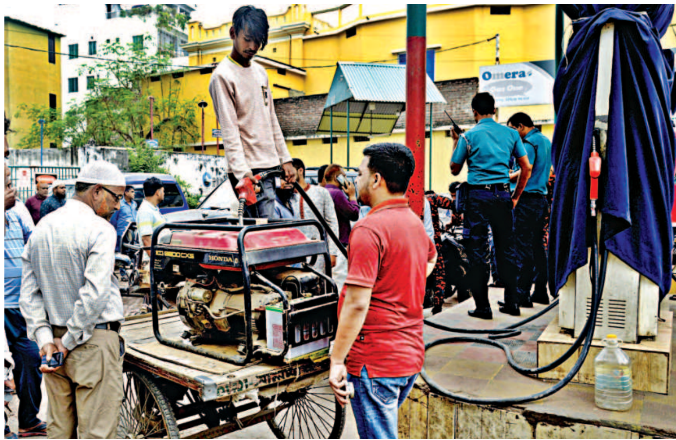
As fuel is no longer sold in jerrycans, people are bringing generators and irrigation machines to collect diesel from the pumps in Rajshahi. Most pumps remain closed, while queues stretch 1.5km to 2km long at four to five that are open. Some people complained that they did not get fuel even after lining up from 3:00am. This photo was taken at Gul Gafur Petrol Pump in the city yesterday.