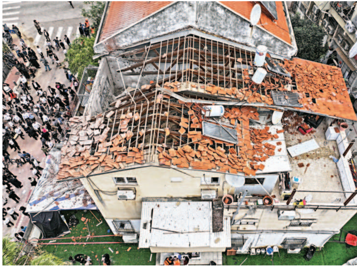
Drone view shows people gathering at a damaged residential area in Bnei Brak, central Israel, after Iranian missile barrages yesterday.

"With reference to media reports regarding the use of military bases, the government reiterates that Italy acts in full compliance with existing international agreements and with the policy guidelines set out by the government to parliament," a government statement said.