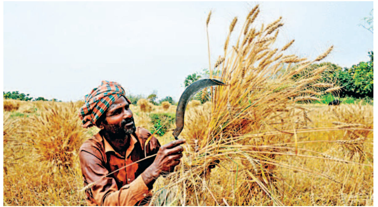
A farmer displays his wheat harvest before taking it for threshing and cleaning in Deopara union of Godagari upazila in Rajshahi. Despite a good yield across the Barind region, including Naogaon and Chapainawabganj, farmers remain worried about prices. The photo was taken recently.