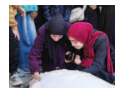
Israeli fire kills four in Gaza, West Bank