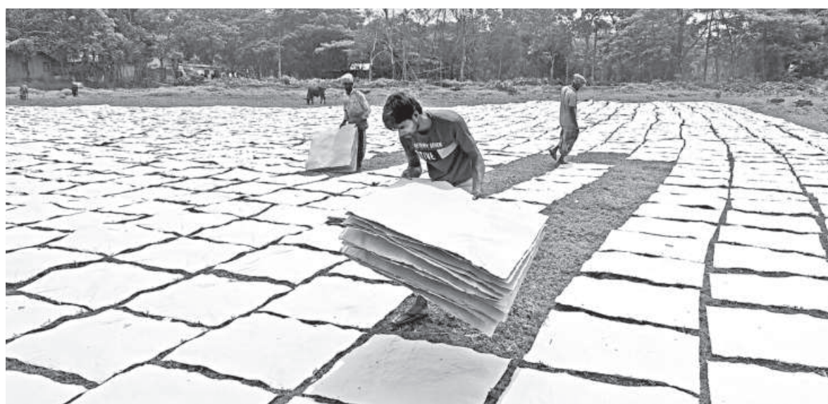
Workers lay out cardboard sheets, used to make packaging boxes for sweets, shoes and clothing, to dry under the sun. Each labourer earns around Tk 2,500 to Tk 3,000 per week, working from morning to afternoon. The photo was taken from the Haripasha area of Barishal city yesterday.