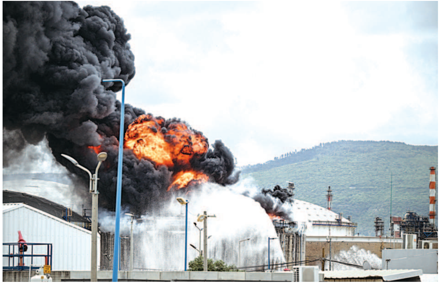
A blaze erupts after debris from an intercepted Iranian missile hit an industrial building and fuel tanker at Israel's Oil Refineries in Haifa yesterday.