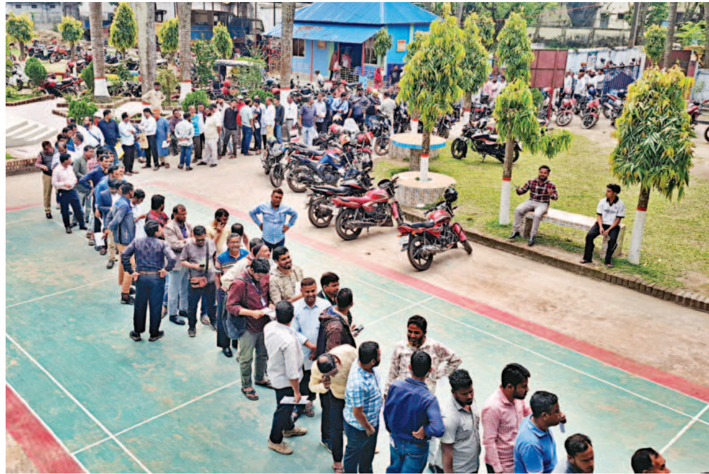
Motorcyclists line up at a municipality office in Thakurgaon town yesterday to collect "fuel cards" now mandatory from April 5 amid the ongoing fuel crisis. Similar lines were seen at UNO, municipality, and DC offices in the district as drivers scrambled to secure the required permits.