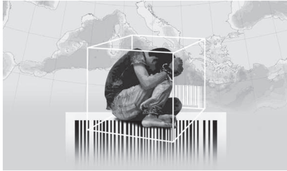
VISUAL: ANWAR SOHEL

Finally, it is imperative to establish effective institutional support systems for Bangladeshis in distress abroad. Many migrants who travel without proper documentation face detention, abuse, or legal complications but fail to receive timely assistance. Strengthening embassy capacities, establishing emergency helplines, providing legal aid, and actively protecting labour rights are crucial. At the same time, safe and dignified repatriation mechanisms must be ensured for those wishing to return home.