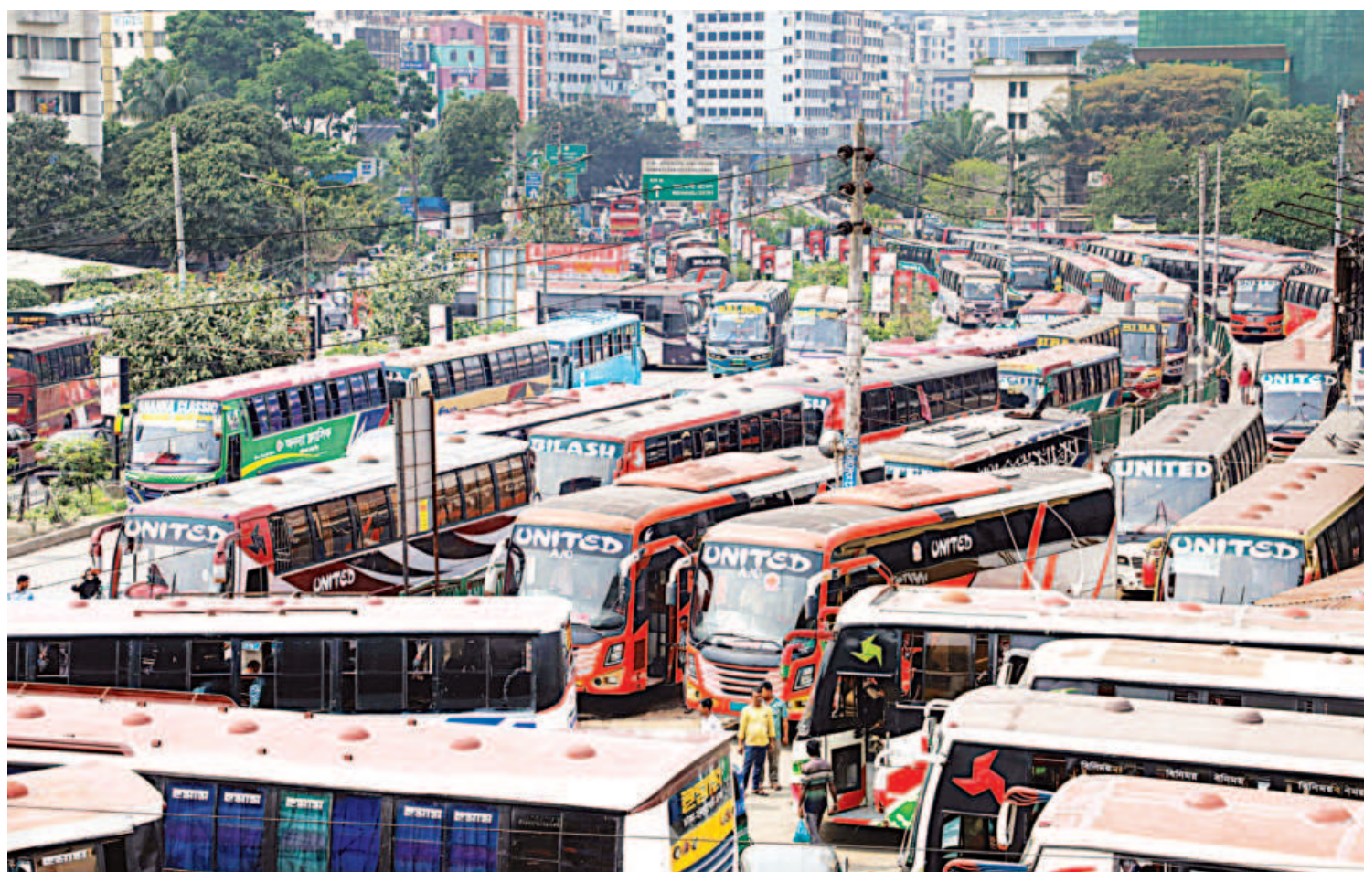
Illegally parked buses in the middle of the road obstructing vehicular movement and triggering traffic congestion near the Mohakhali bus stand in Dhaka yesterday.