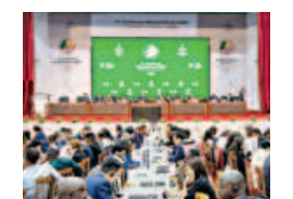
WTO conference concludes without major agreements