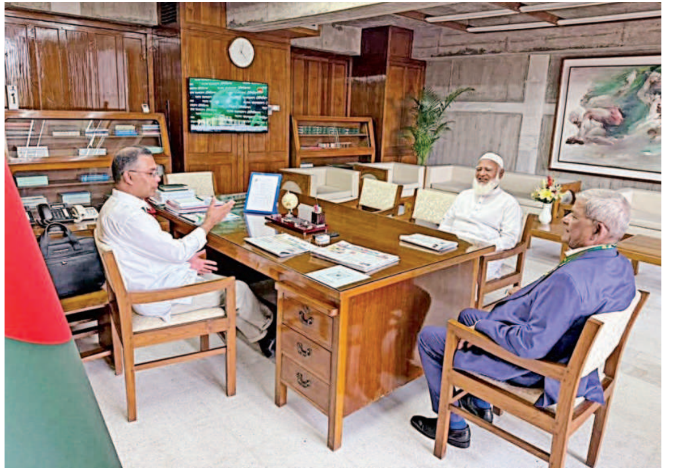
Opposition leader and Jamaat-e-Islami Ameer Shafiqur Rahman meeting with Prime Minister Tarique Rahman and LGRD Minister Mirza Fakhrul Islam Alamgir at the Parliament Secretariat yesterday.

The effective closure of the Strait of Hormuz, a narrow channel along the Iranian coast, has stopped the passage of 20 percent of the world's oil and liquefied natural gas and a major portion of fertiliser since the US and Israel began airstrikes on Iran on February 28. Much of it was bound for Asia, including China, India, Japan and South Korea.