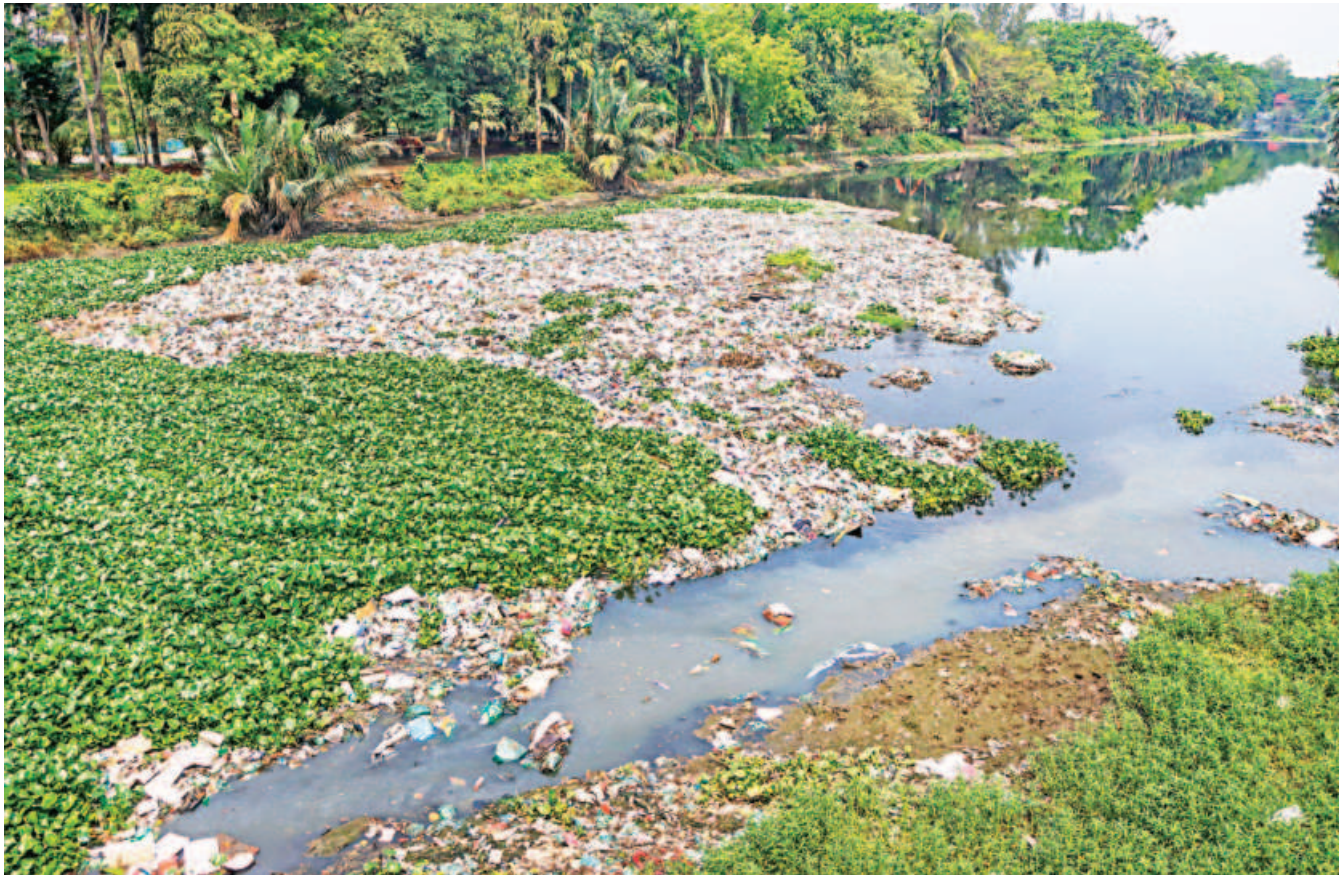
Non-biodegradable waste clogs the Mayur River in Khulna, disrupting its flow and causing severe pollution. Polythene, plastic bottles, and other discarded materials are narrowing the channel, leading to stagnant water and raising the risk of waterlogging during the monsoon. The pollution also threatens local livelihoods, agriculture, and aquatic life. The photo was taken in the Gallamari area yesterday.