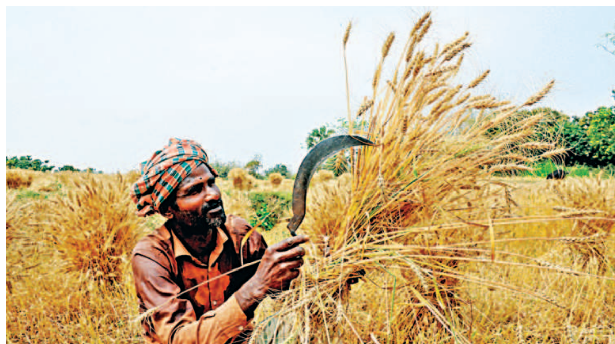
A farmer displays his wheat harvest before taking it for threshing and cleaning in Deopara union of Godagari upazila in Rajshahi. Despite a good yield across the Barind region, including Naogaon and Chapainawabganj, farmers remain worried about prices. The photo was taken recently.