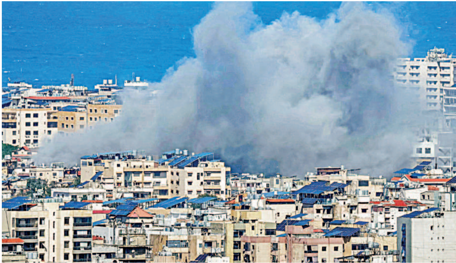
Smoke rises from the site of an Israeli airstrike on Beirut's southern suburbs yesterday. A United Nations peacekeeper was killed in southern Lebanon overnight, prompting condemnations yesterday after a bloody weekend in which Lebanese journalists and medics were killed in Israeli strikes.

US Representative Nancy Mace, a Republican, has said Congress should have a say in any decisions to deploy troops to Iran, further underscoring division within President Trump's political party.