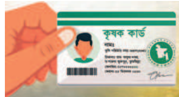
Selected farmers will receive Tk 2,500 through the card to purchase fertiliser, seeds, pesticides, and other agricultural inputs.

In this phase, the cards will be distributed through Sonali Bank branches in 11 upazilas — Adarsha Sadar in Cumilla, Teknaf in Cox's Bazar, Tangail Sadar in Tangail, Shibganj in Bogura, Islampur in