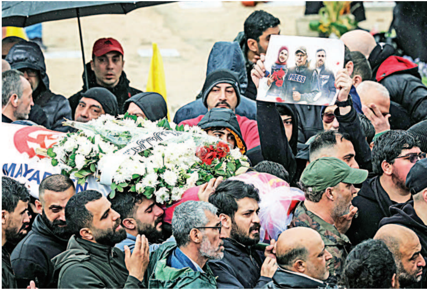
Mourners carry the body of one of the journalists killed a day earlier in an Israeli strike in south Lebanon, during a funeral in the Choueifat area on the outskirts of Beirut yesterday.

The officials want any deal to lock in enforceable restraints on missile and drone attacks on energy and civilian assets, threats to oil and shipping routes,