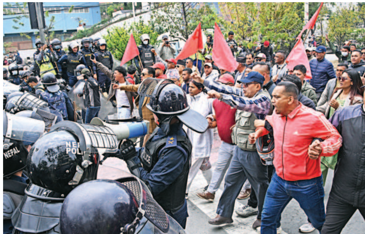
Supporters protest the arrest of Nepal's former prime minister KP Sharma Oli in Kathmandu, Nepal yesterday. Nepal's former energy minister Deepak Khadka was also arrested as part of an investigation into money laundering, police said.

That message was reinforced by the Gulf Cooperation Council, a group including Bahrain, Kuwait, Saudi Arabia, Qatar, Oman and the UAE, which has signalled a unified front against any settlement that sidelines Gulf security.