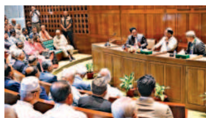
Leader of the House Tarique Rahman at a meeting of BNP parliamentary party in the parliament yesterday.

A proposal was placed to form a committee comprising ruling party MPs, opposition lawmakers, and academics to examine the issue further, sources said.