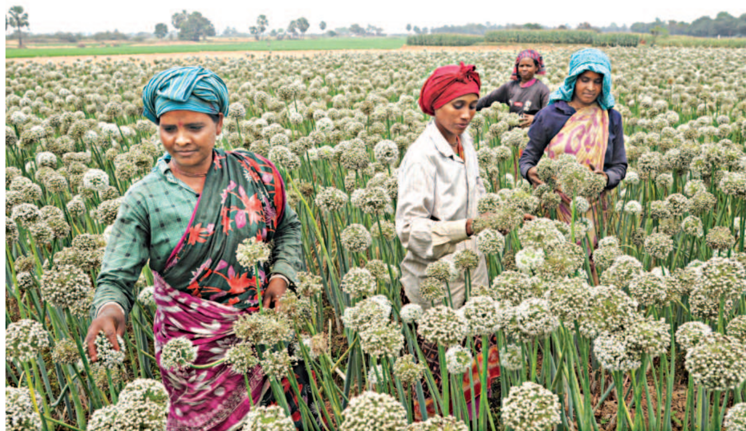
Farmers manually pollinate onion flowers in the Naldanga area of Natore, as excessive pesticide use has driven away bees and butterflies, disrupting natural pollination. Despite this, growers say seeds are forming and will be harvested after drying, with hopes of good prices. The photo was taken recently.

ইসলামী ব্যাংকিং সেবা প্রদানে 'ইসলামী ব্যাংকিং কর্ণার' পূবালী ব্যাংকের প্রায় সকল শাখা এবং উপশাখায়