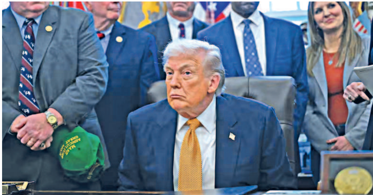
US President Trump said he was “shocked” at Iran’s retaliation, as if experts never warned against military misadventures in the Middle East.