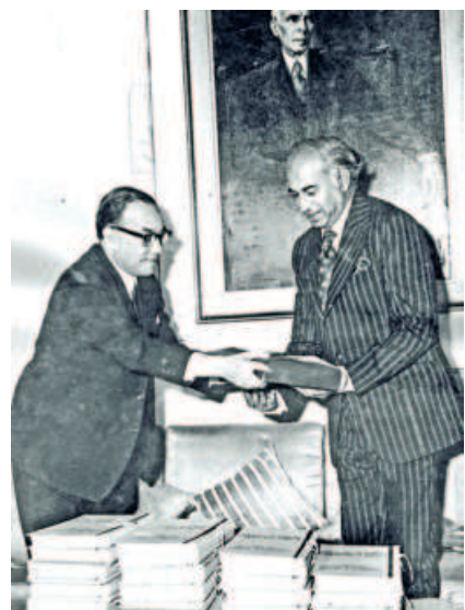
Justice Hamoodur Rehman presenting the report to Prime Minister Zulfikar Ali Bhutto, 1972.

evidence is the testimony about "Bangladesh" itself. Officers told the Commission that when a suspected Bengali was "being sent to Bangladesh", it was code that he would never come back. To quote directly: "being sent to Bangladesh — a code name for death without trial, without detailed investigations and without any written order by any authorised authority". This single line says it all: inside the army, "Bangladesh" did not mean exile or transfer—it meant summary execution.