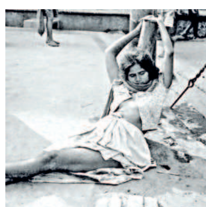
A survivor of the Pakistan Army's atrocities [Bangladesh Agricultural University, Mymensingh, December 11, 1971].

Signals in the silence: Witness testimonies