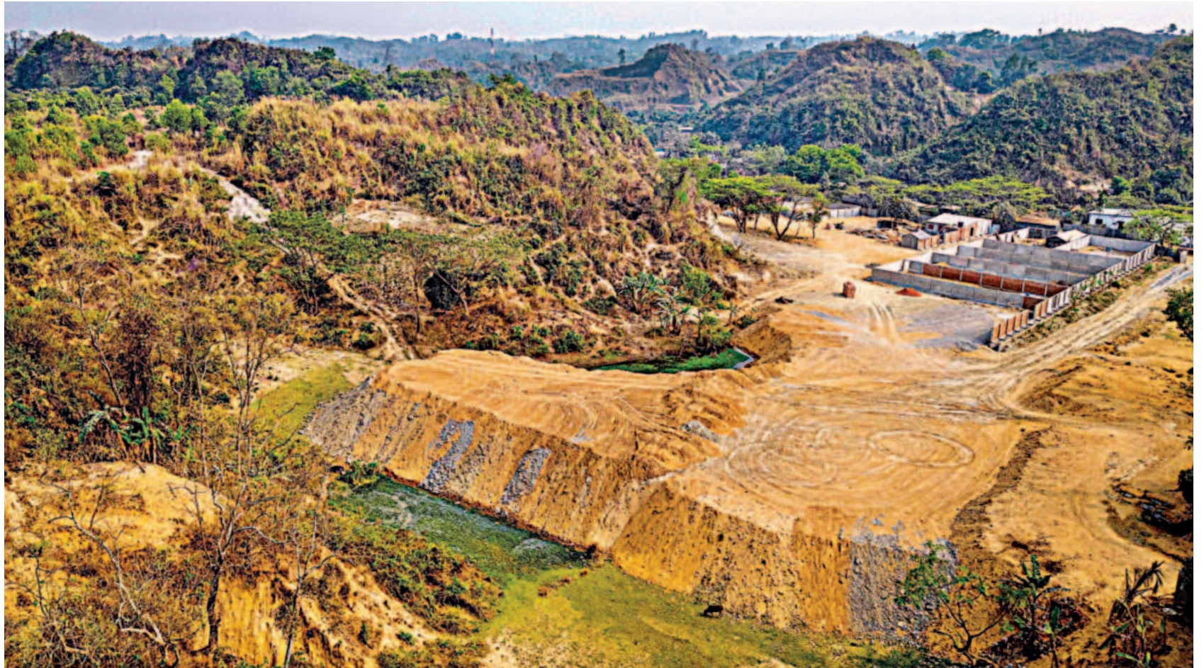
Markets, roads, and homes are being built by cutting the hills of Jungle Salimpur at Alinagar in Sitakunda, Chattogram. The razed hills of the area lay bare the environmental impact of encroachment. This photo was taken recently.

But the Iranian side, which has made it clear it wants to end fighting on its own terms, said it has not requested the 10-day pause on strikes on