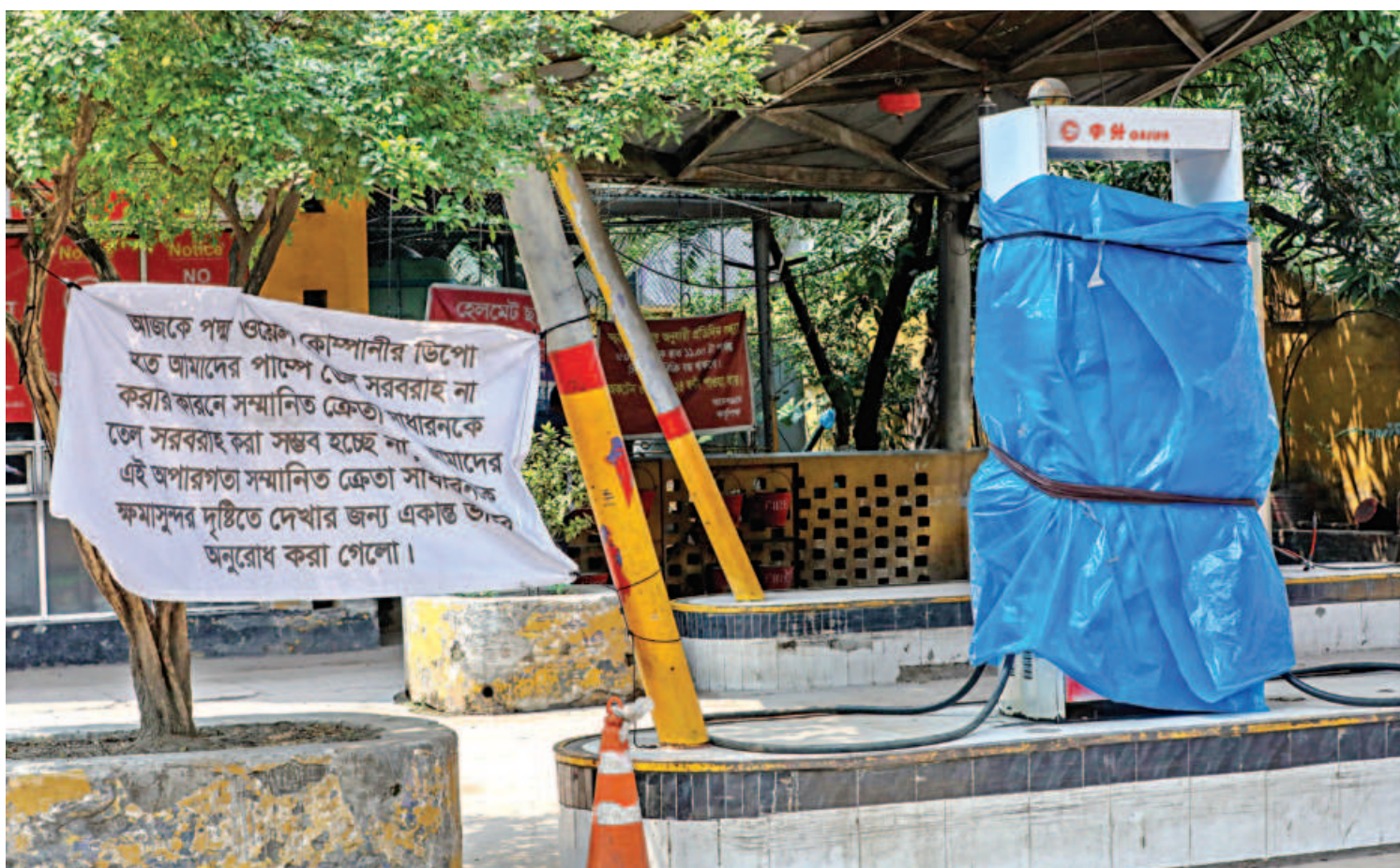
A filling station at Paribagh in Dhaka puts up a notice yesterday afternoon, apologising to customers for inability to sell fuel due to what it says is no supply from Padma Oil Company depot. An official at the pump said it gets oil every other day amid the crisis triggered by the US-Israel war on Iran but there has been no supply since Wednesday, and fresh supply is unlikely until Sunday.