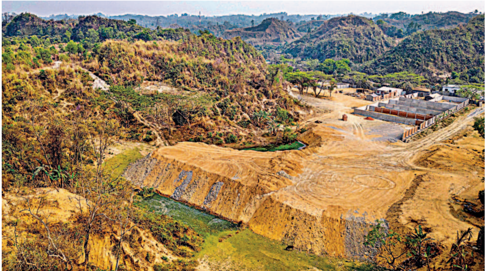
Markets, roads, and homes are being built by cutting the hills of Jungle Salimpur at Alinagar in Sitakunda, Chattogram. The razed hills of the area lay bare the environmental impact of encroachment. This photo was taken recently.

But the Iranian side, which has made it clear it wants to end fighting on its own terms, said it has not requested the 10-day pause on strikes on