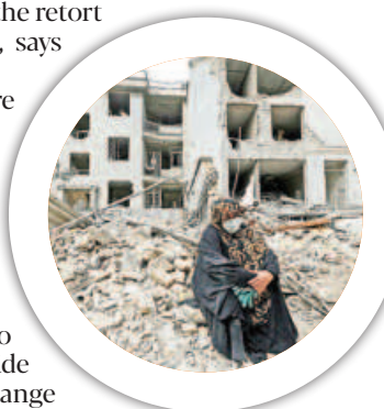
A first responder surveys damage after Iranian missile strikes in central Israel, early yesterday. At least two Israelis, both men in their 50s, have been injured in a Hezbollah missile attack on the northern city of Karmiel.