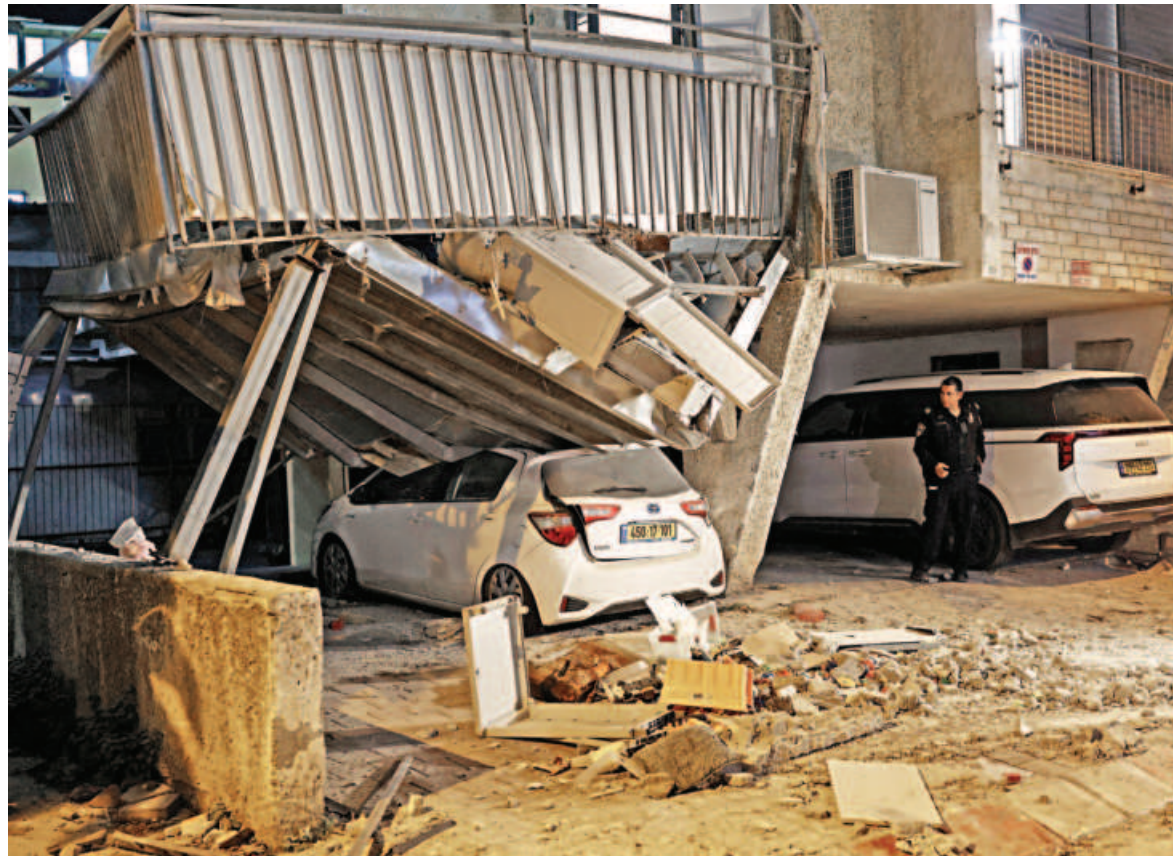
A first responder surveys damage after Iranian missile strikes in central Israel, early yesterday. At least two Israelis, both men in their 50s, have been injured in a Hezbollah missile attack on the northern city of Karmiel.