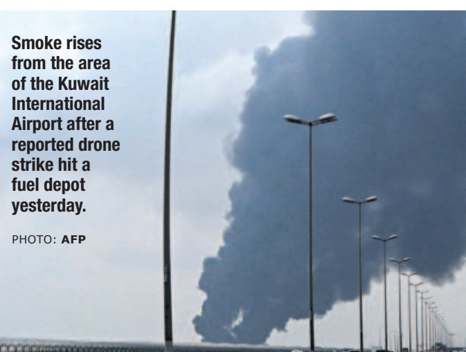
Smoke rises from the area of the Kuwait International Airport after a reported drone strike hit a fuel depot yesterday.

US President Donald Trump has sent a 15-point plan to Iran via Pakistan, which has offered to