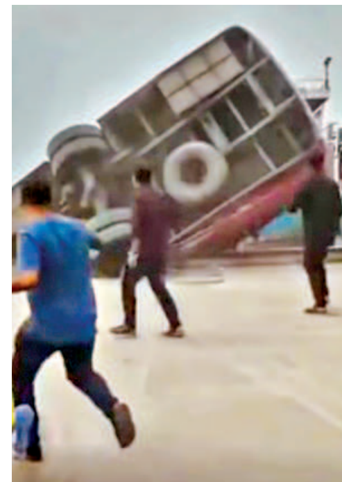
Screengrabs of footage widely circulated on social media show a bus falling into the Padma river from a pontoon of Daulatdia ferry terminal in Rajbari around 5:15pm yesterday. The Dhaka-bound bus of Souhardo Paribahan was from Kushtia's Kumarkhali upazila.