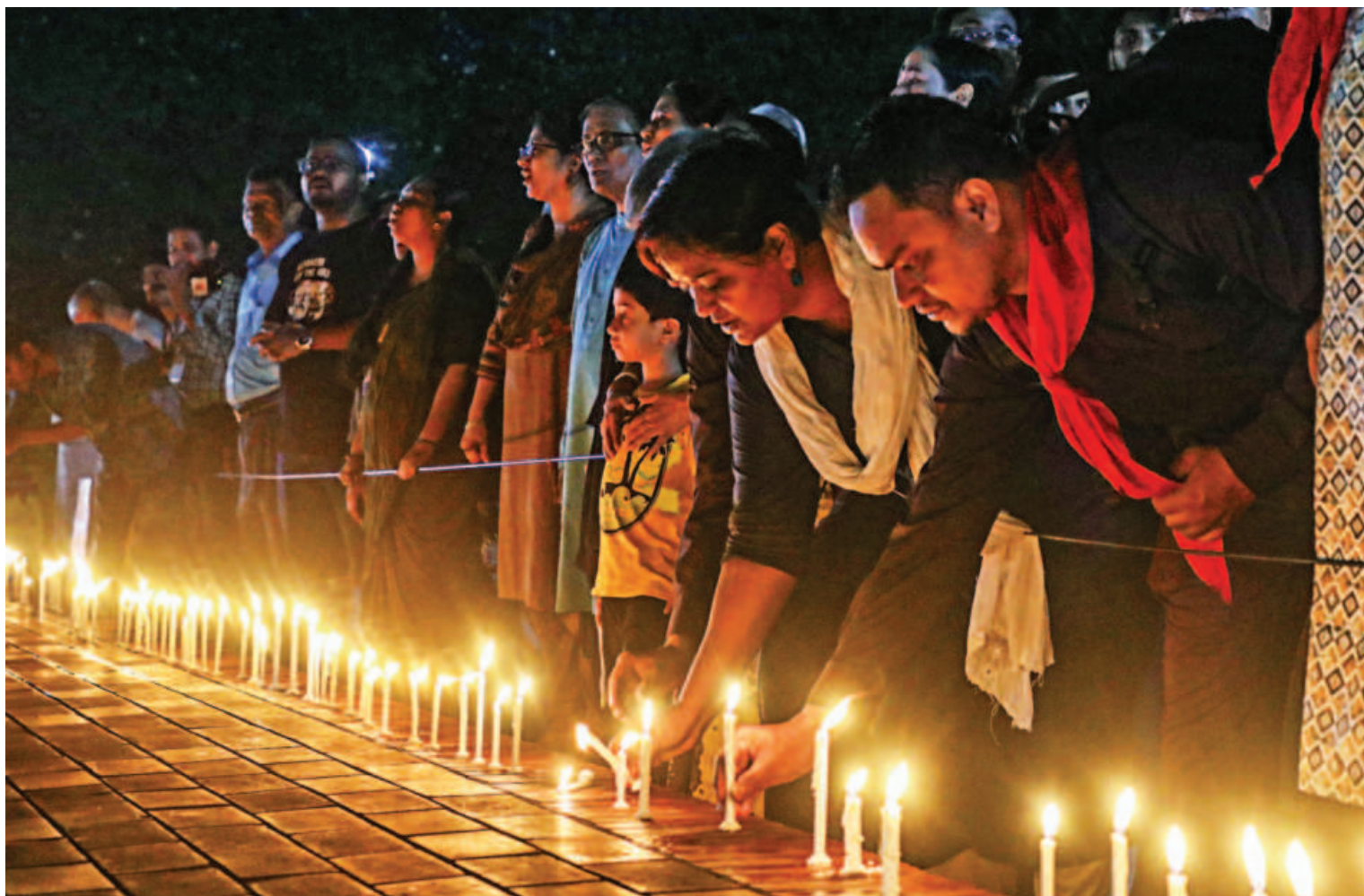
People of all ages light candles in remembrance of the victims of the 'Black Night' of March 25, 1971, as Udichi Shilpigosthi and Chhatra Union hold a torch procession and candle-lighting programme at Shikha Chirantan in the capital's Suhrawardy Udyan last night.