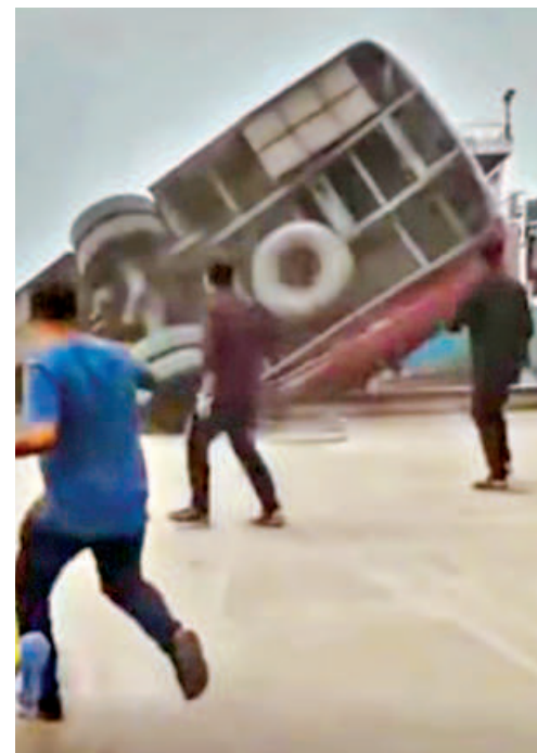
Screengrabs of footage widely circulated on social media show a bus falling into the Padma river from a pontoon of Daulatdia ferry terminal in Rajbari around 5:15pm yesterday. The Dhaka-bound bus of Souhardo Paribahan was from Kushtia's Kumarkhali upazila.