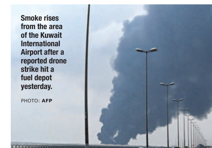
Smoke rises from the area of the Kuwait International Airport after a reported drone strike hit a fuel depot yesterday.

US President Donald Trump has sent a 15-point plan to Iran via Pakistan, which has offered to