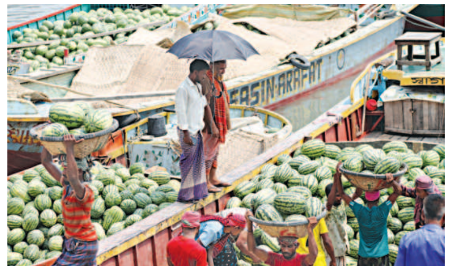
Workers unload watermelons from trawlers for sale at temporary wholesale markets along Port Road beside the Kirtankhola River in Barishal yesterday. Depending on size and quality, 100 watermelons sell at wholesale prices ranging from Tk 2,000 to Tk 10,000, while a labourer earns around Tk 1,000 a day working from morning till night.