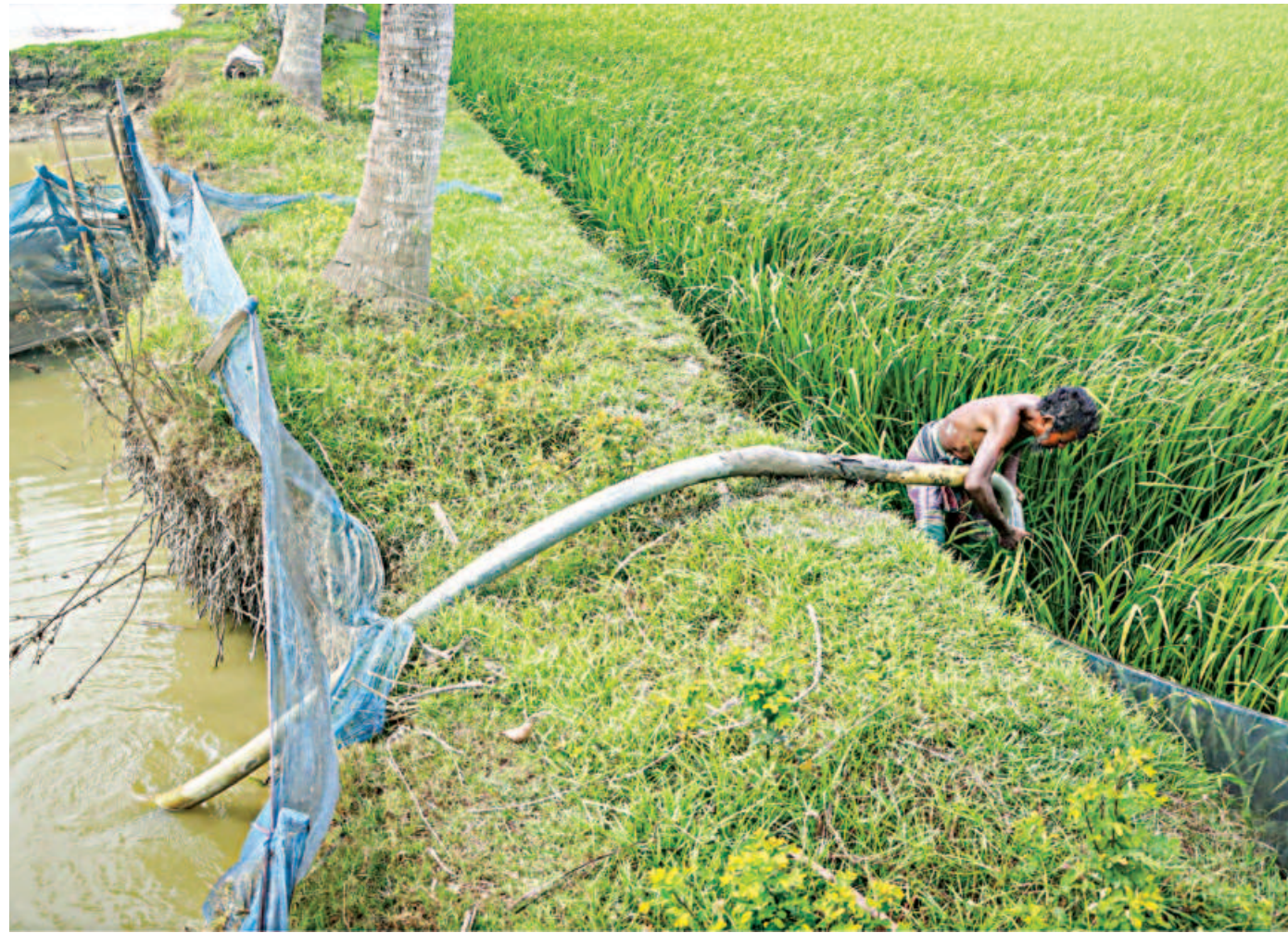
A farmer tries to siphon water from a pond to his Boro paddy field in Dumuria upazila of Khulna yesterday as growers face a mounting crisis of irrigation due to a shortage of fuel to run pumps amid the US-Israel war on Iran.