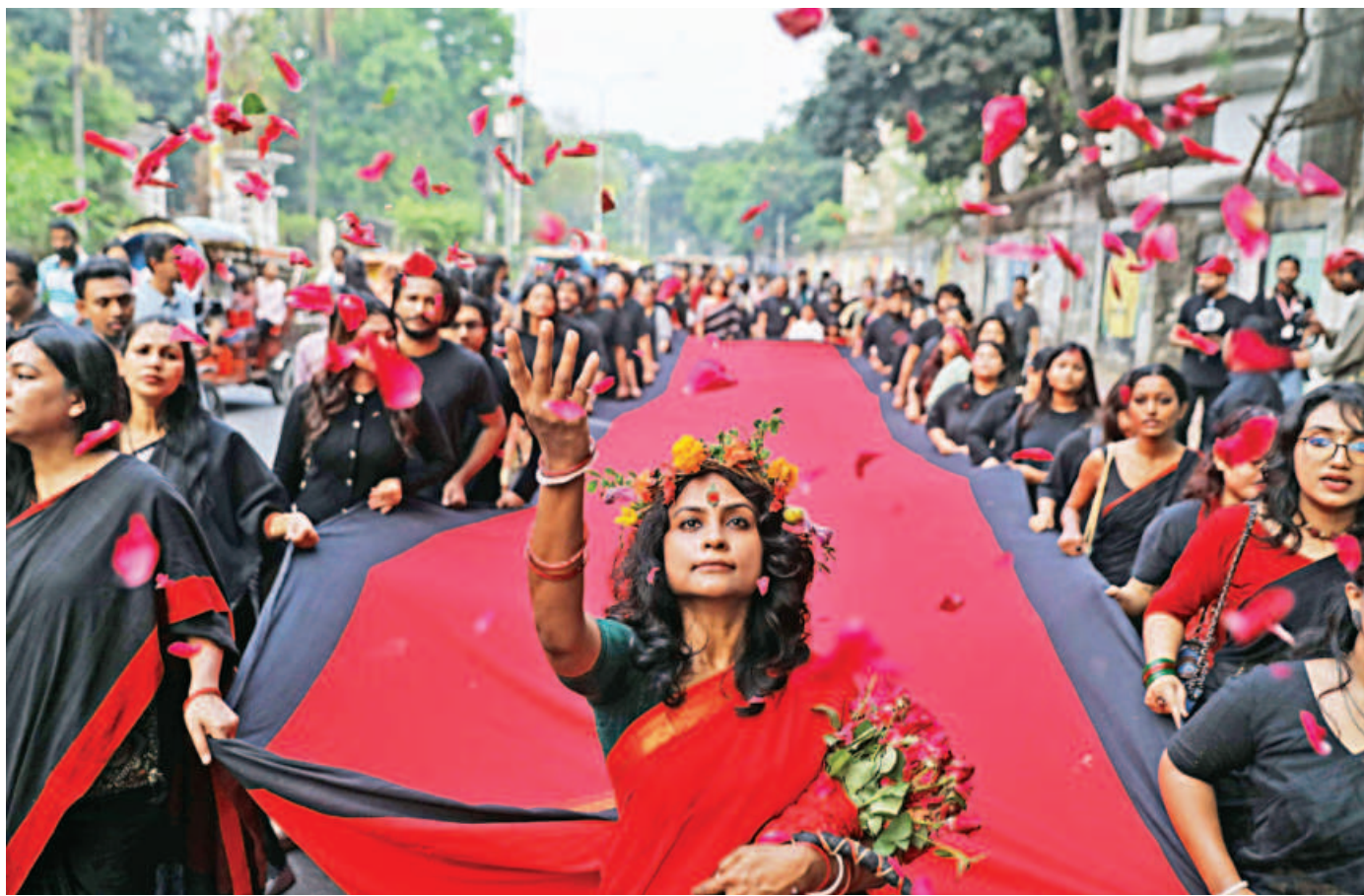
Theatre group Prachyanat School of Acting and Design yesterday brought out its "Lajatra" procession after a street show at Soparjito Swadhinota Chattar at TSC, Dhaka University, and marched to Smriti Chirantan Chattar to commemorate the victims of the genocide carried out by the Pakistan army on unarmed Bangalees on the night of March 25, 1971.