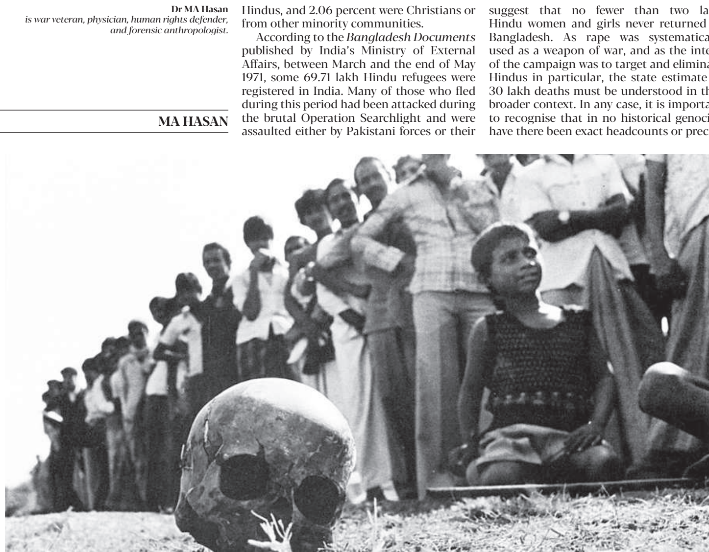
'More than one crore people were registered as refugees in India during the war of 1971, and nearly two crores were internally displaced.'

The research, conducted between 1991 and 2002 across 42 districts and their police stations, drew on countless interviews. The