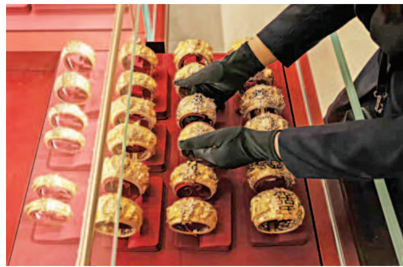
A shop attendant displays pairs of gold bracelets for Chinese weddings at a store in Hong Kong, China.

The rise in energy prices caused by the war has increased inflation concerns and made higher interest rates globally more likely. While gold is considered an inflation hedge, high interest rates reduce the non-