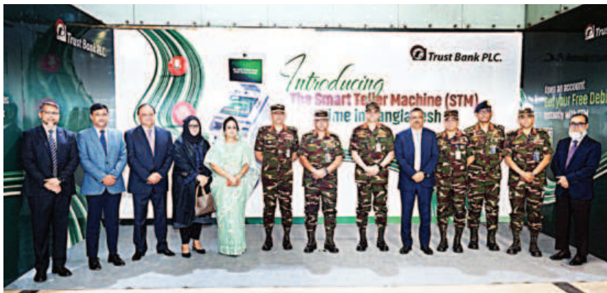
Chief of Army Staff General Waker-Uz-Zaman, chairman of Trust Bank PLC, poses for a group photograph after launching the new services of Smart Point and the Smart Teller Machine in Dhaka recently.

The launch of the Smart Point and STM reinforces Trust Bank's strategic focus on innovation, digital transformation, and customer-centric banking services. The bank plans to gradually expand Smart Points across multiple locations in the country.