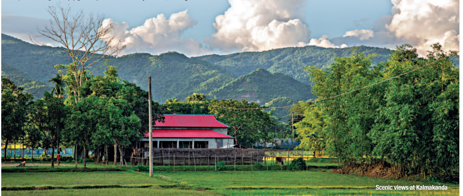
Scenic views at Kalmakanda

The site pays homage to seven valiant freedom fighters who sacrificed their lives in a historic battle that took place on 26 July, 1971, in Kalmakanda.