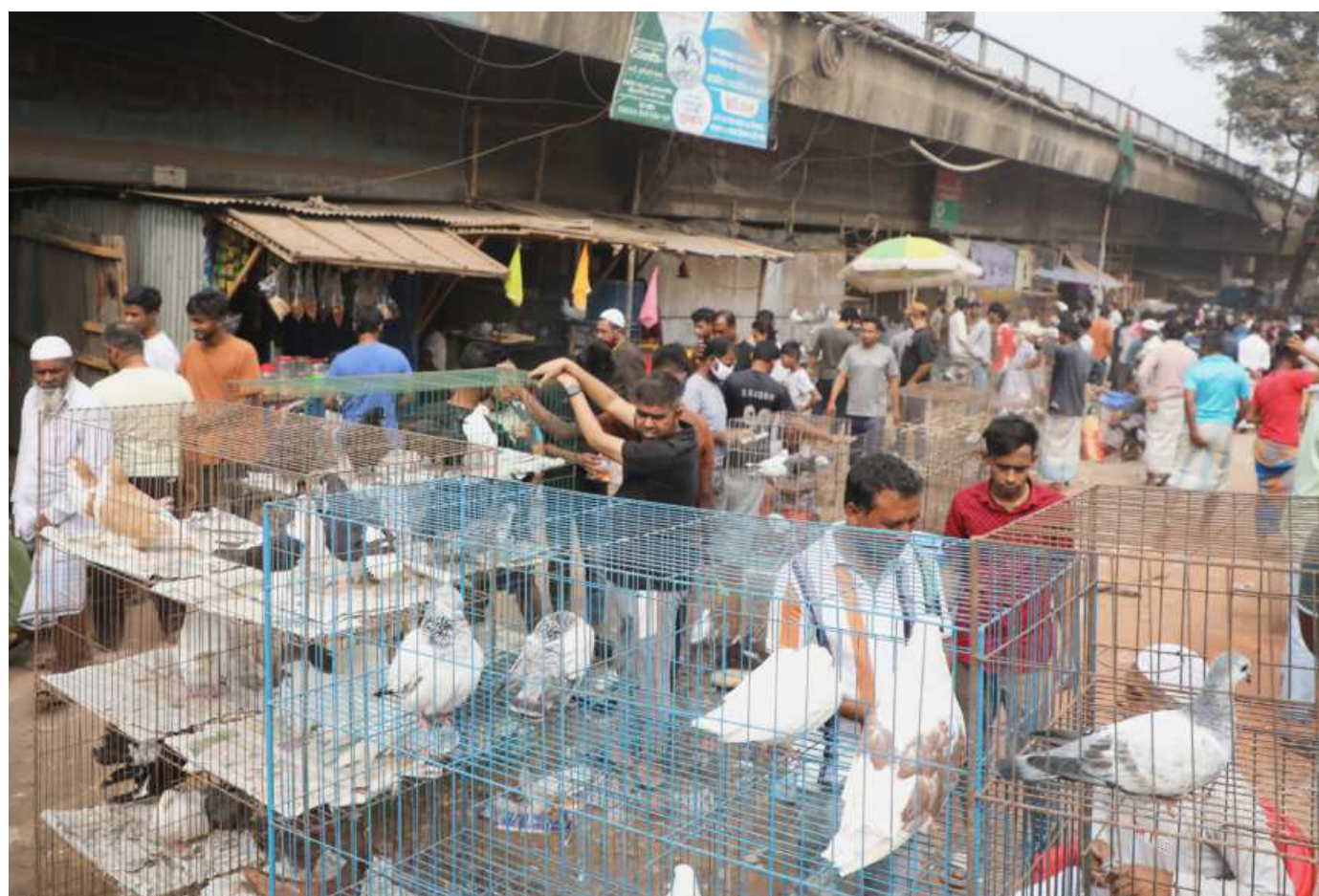
Customers look at a wide variety of pigeons at the popular 'Kobutorer Haat', held in the Hasnabad area of Dhaka every Wednesday and Saturday. Depending on the type of pigeon, each is sold at around Tk 250 to Tk 5,000. The photo was taken yesterday.