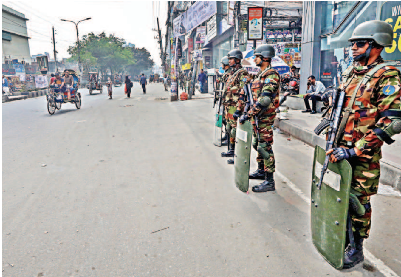
Army personnel stand guard as part of being deployed to heighten security measures around the capital ahead of the 13th parliamentary election, scheduled for February 12. The photo was taken on Ring Road in the Mohammadpur area yesterday.