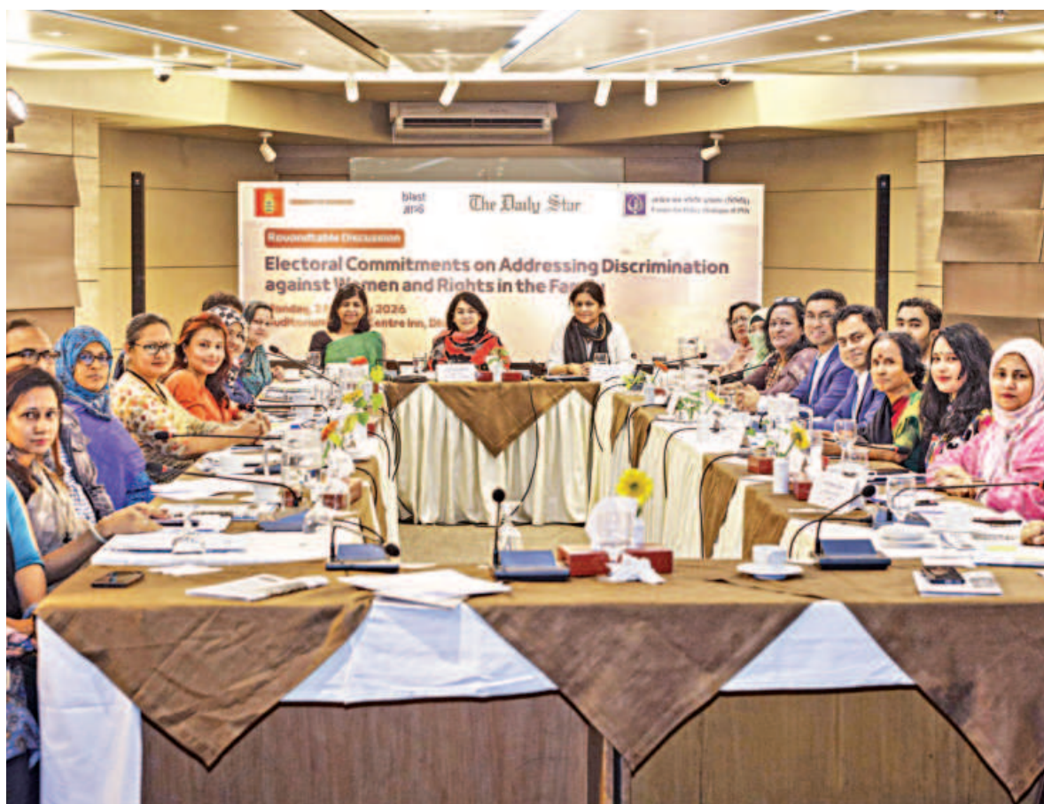
Speakers at a roundtable titled 'Electoral Commitments on Addressing Discrimination against Women and Rights in the Family' at BRAC Centre Inn in Mohakhali, Dhaka yesterday. The Embassy of Denmark, Bangladesh Legal Aid and Services Trust, The Daily Star, and the Centre for Policy Dialogue organised the programme.

He also criticised Jamaat Ameer Shafiqur Rahman for his alleged controversial remarks about working women. SEE PAGE 9 COL 2