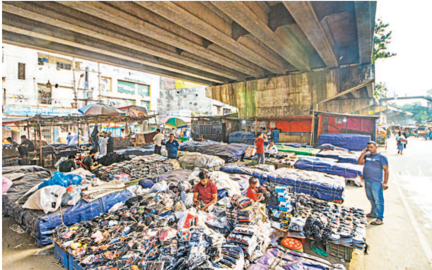
Illegally occupying the space beneath the Babu Bazar Bridge in the capital, makeshift street vendors begin readying for the day's trade, defying existing regulations. The photo was taken recently.