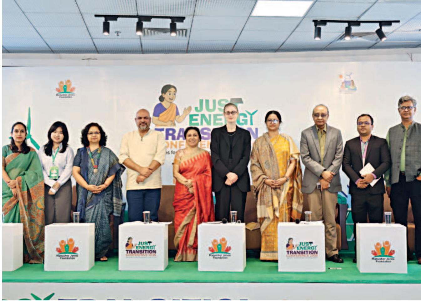
Discussants at the Just Energy Transition Conference 2026, organised by Manusher Jonno Foundation at the Military Museum in the capital yesterday.

"People will read the conditions and then decide how to vote, but realistically, SEE PAGE 9 COL 4