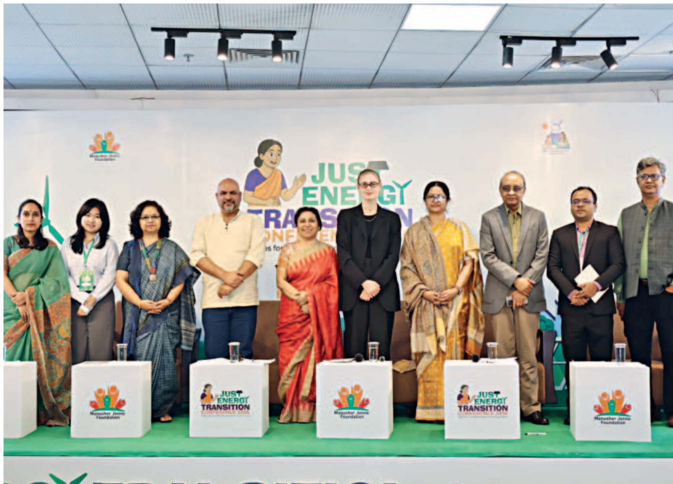
Discussions at the Just Energy Transition Conference 2026, organised by Manusher Jonno Foundation at the Military Museum in the capital yesterday.