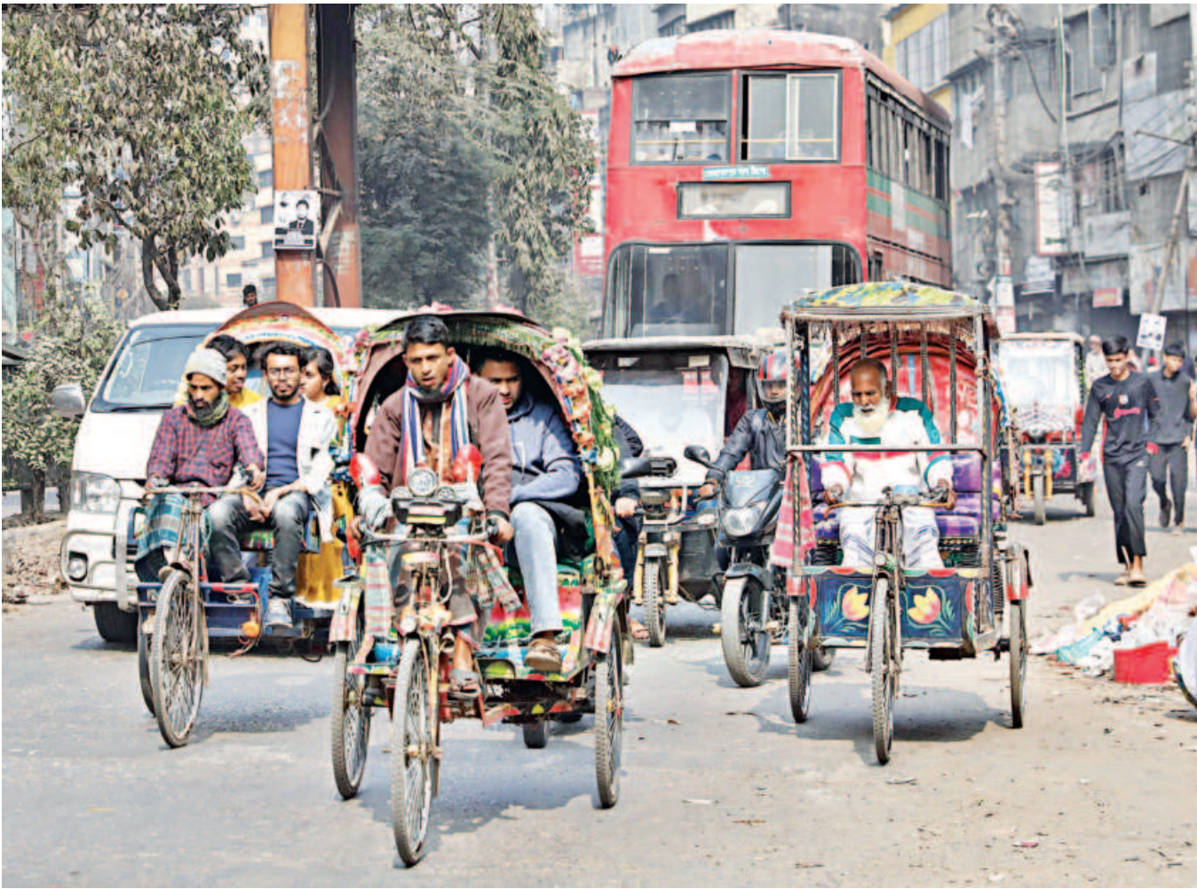
Battery-run auto-rickshaws continue to ply Dhaka streets despite a ban. Although law enforcers carry out drives against them, their operations persist. The photo was taken on North-South Road in the Siddique Bazar area yesterday.