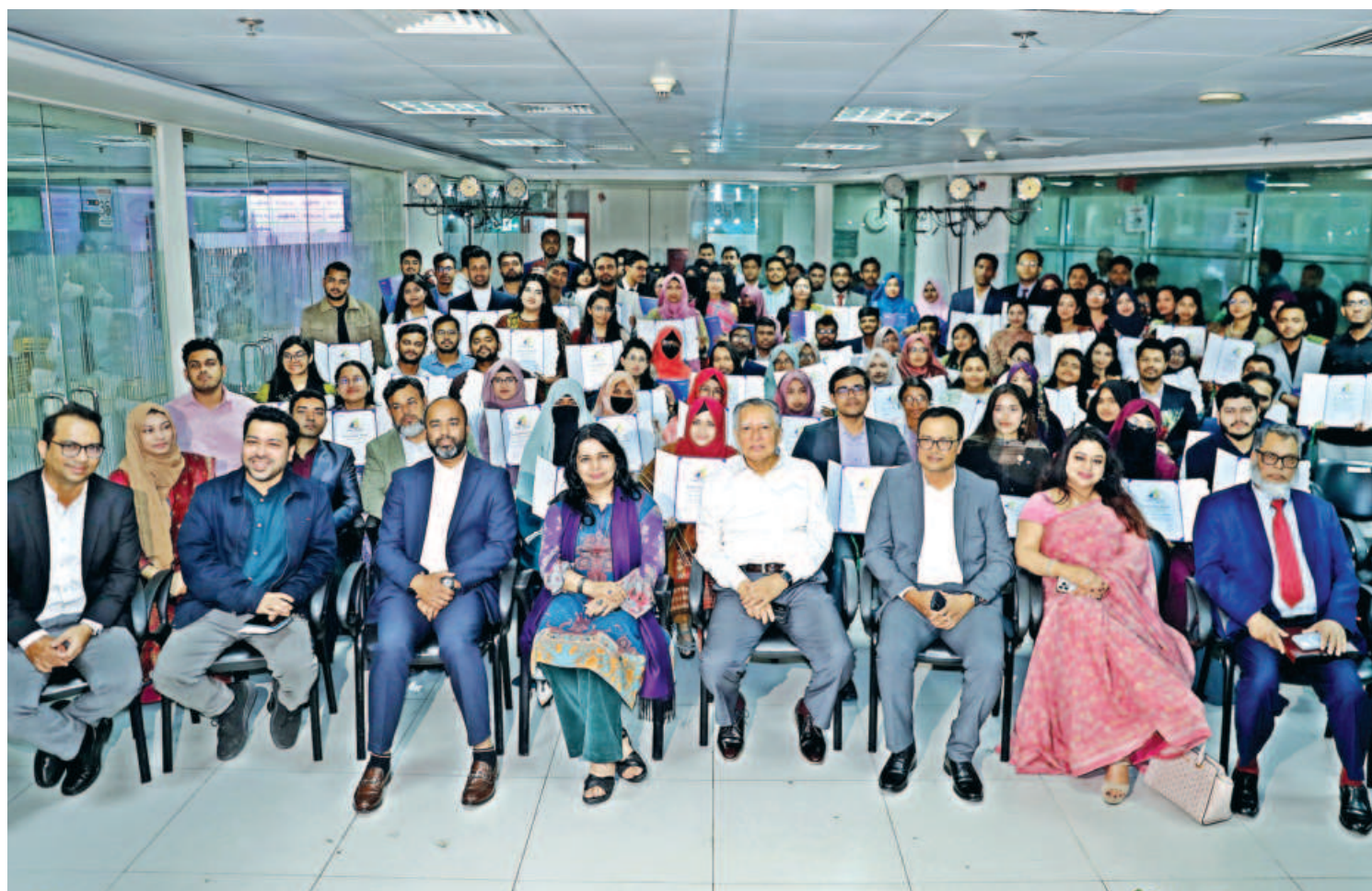
A total of 150 agriculture students received the Prayash Syngenta Scholarship 2025 at a certificate handover ceremony held at The Daily Star Centre yesterday. Jointly initiated by Syngenta Bangladesh and The Daily Star, the scholarship supports those who aspire to contribute to the country's agricultural development.