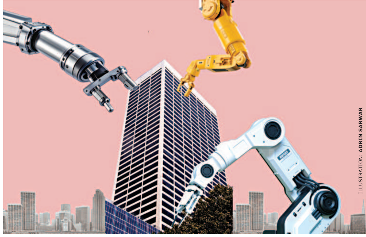
ILLUSTRATION: ADRIN SARWAR

While these machines save lives, they aren't perfect. Despite becoming industry standards, the risk of accidents during Human-Robot Interaction (HRI) remains. If a robot's sensors are blocked by dust or a software glitch occurs, the machine could collide with a worker. To avoid this, competency-based training is essential. Workers are now being trained in Virtual Reality to communicate with robots. Safety in this era isn't just about the machine; it's about prevention. Predictive maintenance can stop accidents before they occur.