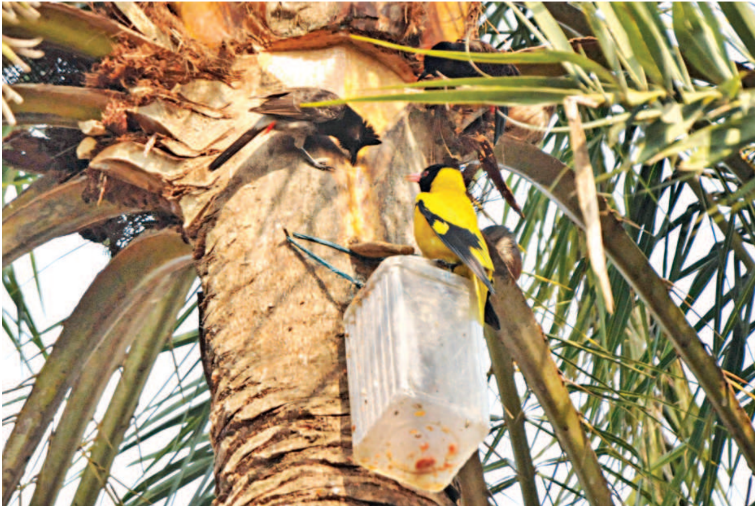
A yellow oriole and two bulbuls gather to drink date palm sap on a sunny afternoon, following the onslaught of winter chills. The photo was taken in Atrai upazila of Naogaon yesterday.