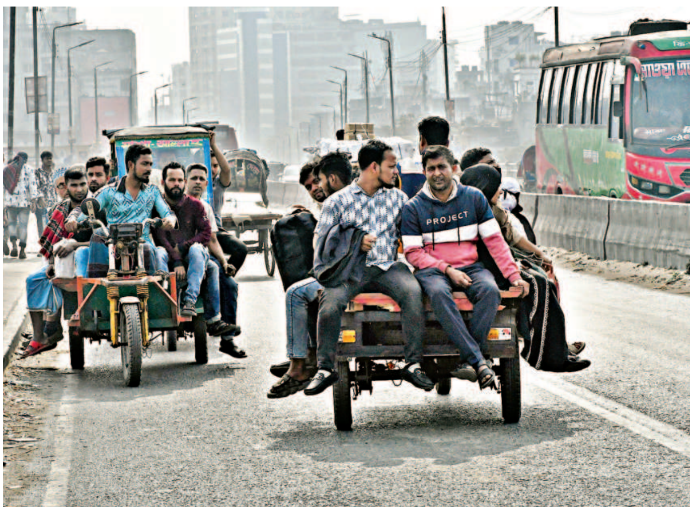
Two human hauliers carrying multiple passengers ply the wrong side of Buriganga Bridge-1 yesterday. Despite being barred from the route, these light vehicles continue to risk their own safety and that of their passengers, defying the law.