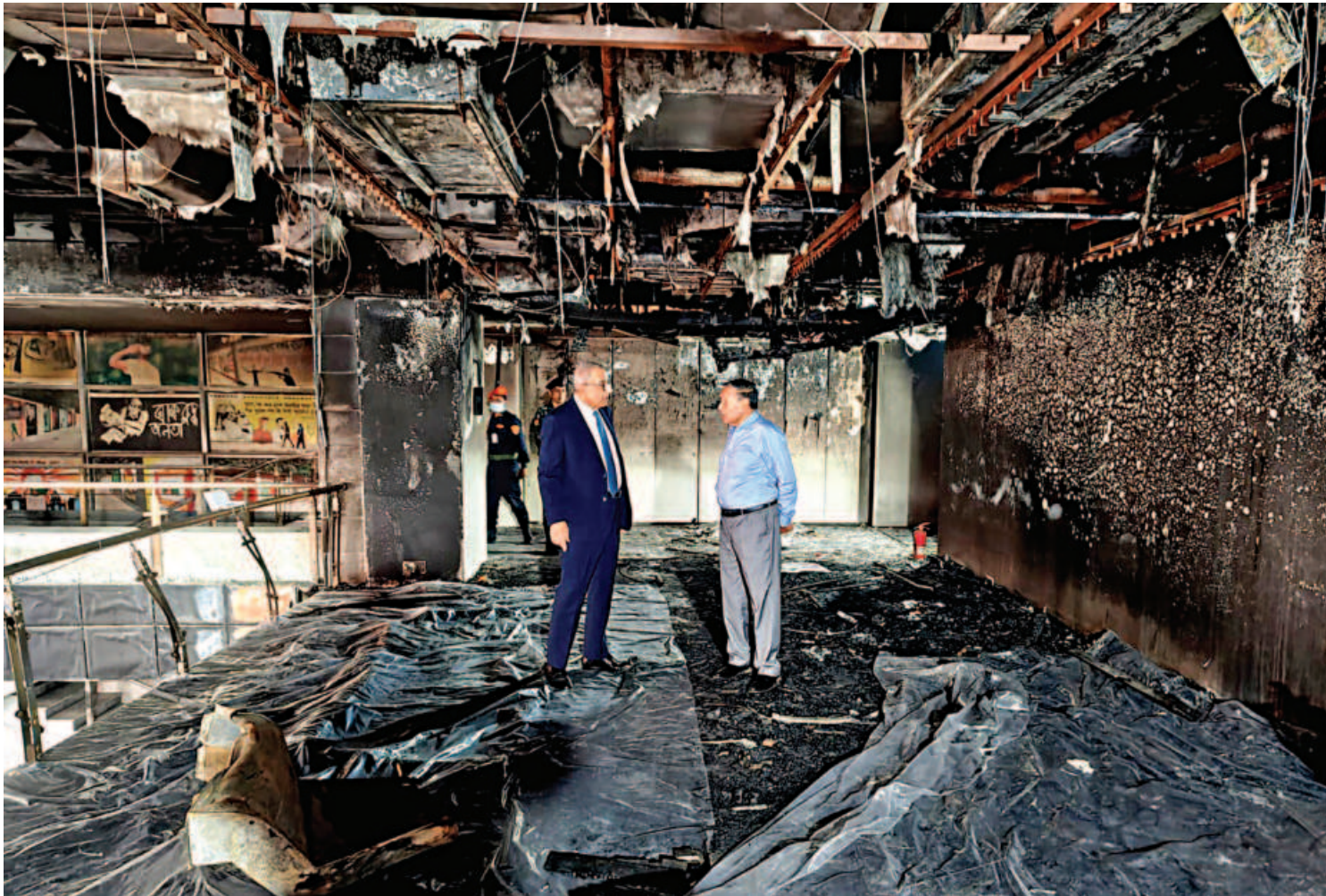
Palestinian Ambassador to Bangladesh Yousef SY Ramadan visited The Daily Star Centre yesterday to express solidarity with the newspaper following the mob attacks and arson at its office on December 19.

He expressed deep appreciation for the newspaper's two special editions on Gaza, as well as its special focus on journalists killed while covering the Israeli offensive.