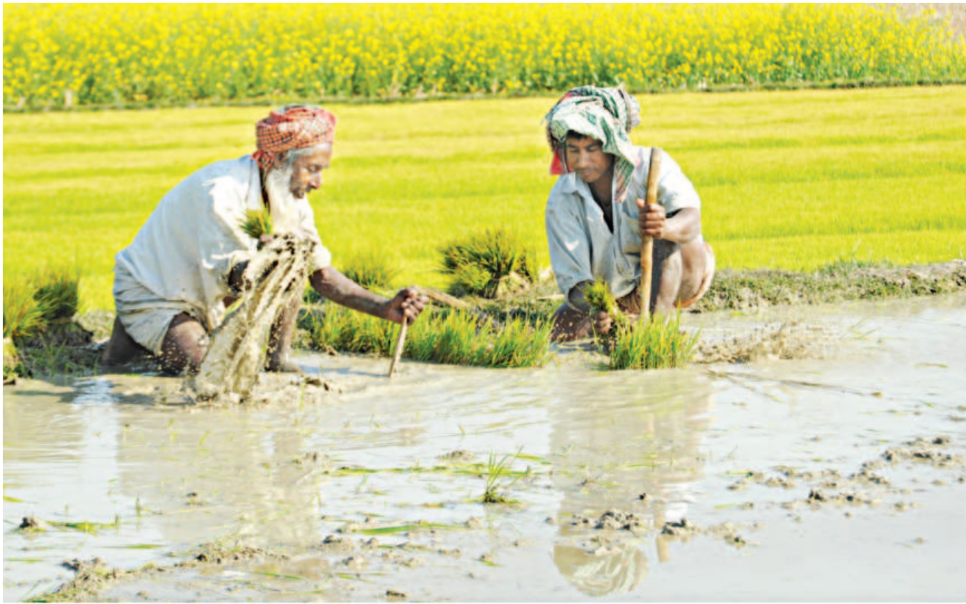
Braving a cold winter morning, two farmers in the Barind region are busy transplanting Boro seedlings. The photo was taken yesterday at Rajabari area of Godagari upazila in Rajshahi.