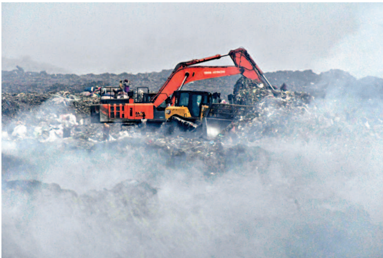
A cloud of smoke envelops the Aminbazar landfill site along the Dhaka-Aricha highway as household waste collected from nearby areas is burnt indiscriminately. Such activities contribute to Dhaka's continuous ranking among the world's most polluted cities, severely impacting the health of residents. The photo was taken yesterday.