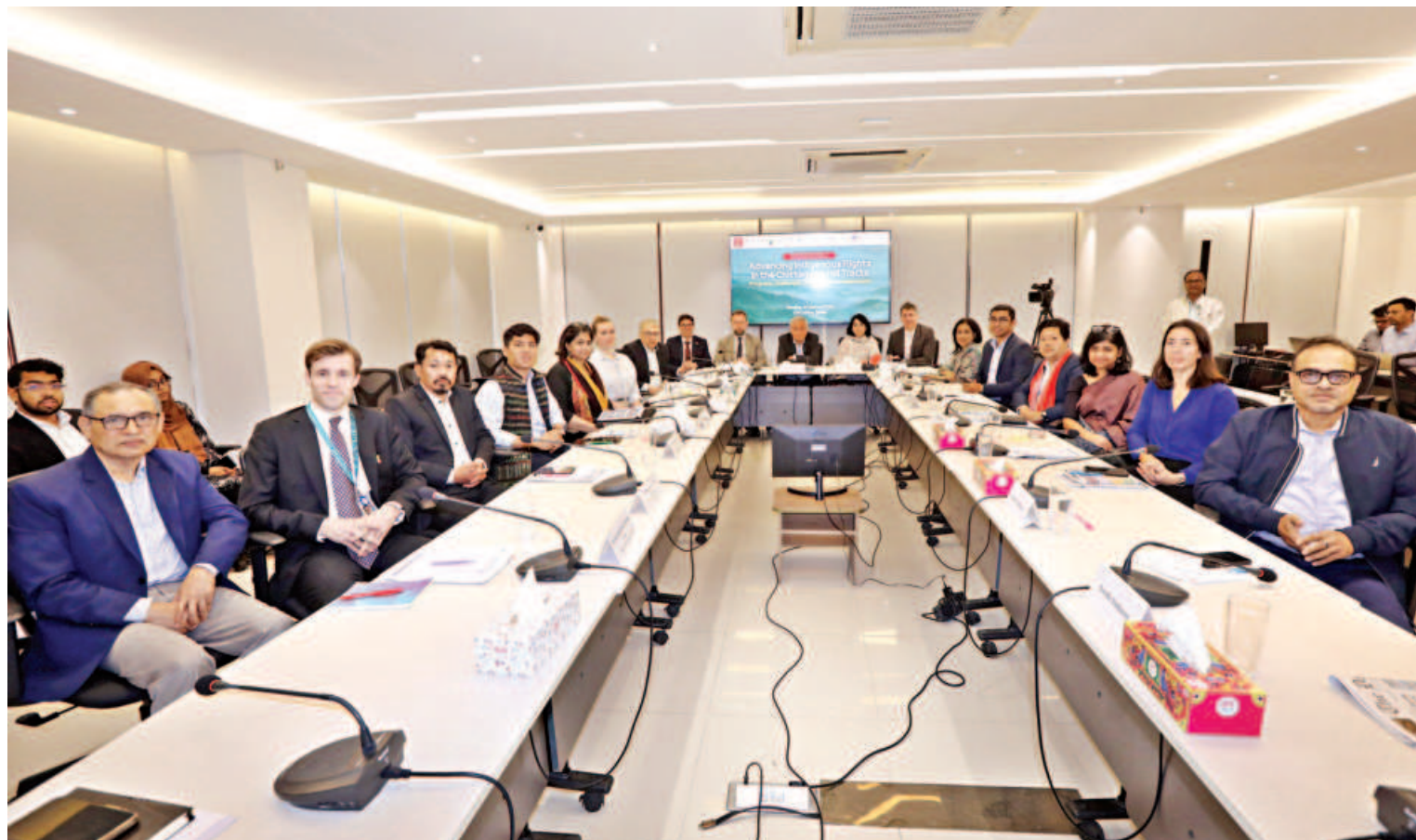
Speakers at a roundtable, titled 'Advancing Indigenous Rights in the Chittagong Hill Tracts: Progress, Challenges, and Political Commitments,' at the CPD office in Dhaka yesterday. The event was jointly organised by the Nordic Embassies in Bangladesh, the Centre for Policy Dialogue, and The Daily Star.