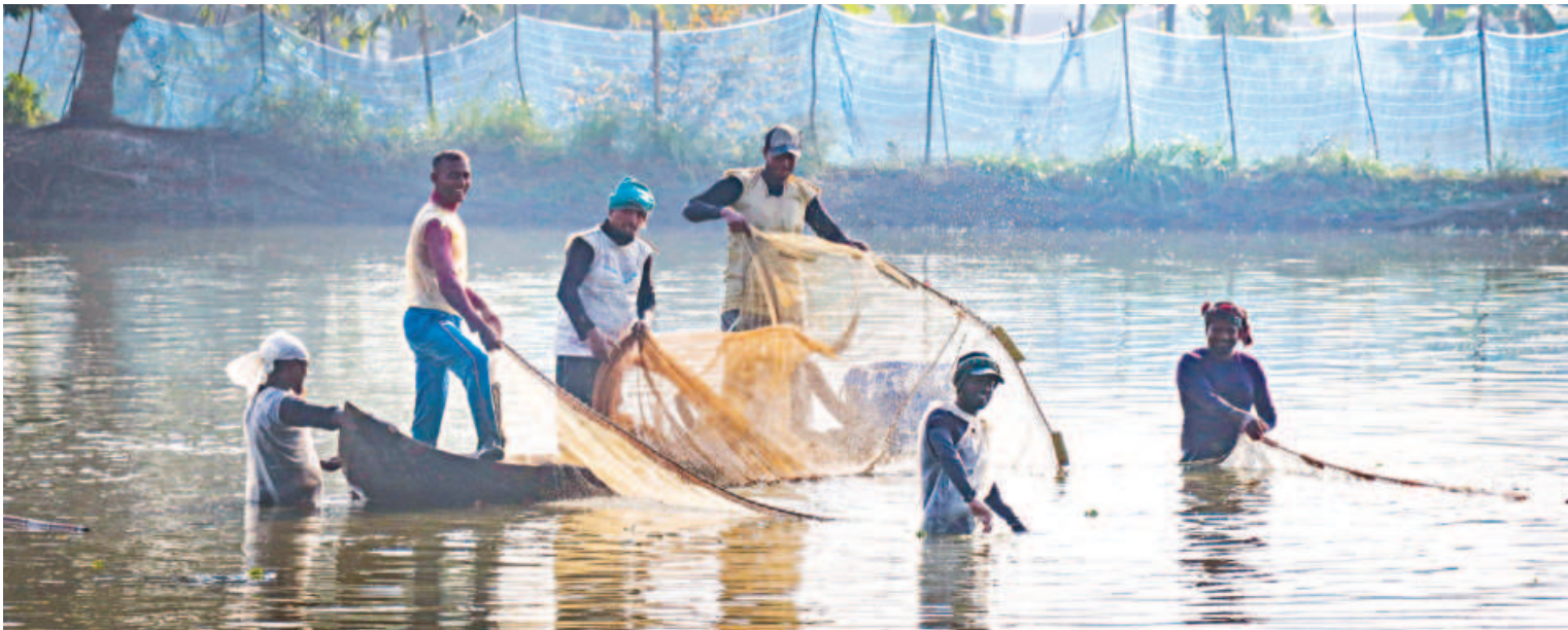
Farm fish accounts for more than half the fish produced annually in Bangladesh. In this photo, fishermen are seen catching carp fries at a farm in Subhasini, Satkhira.