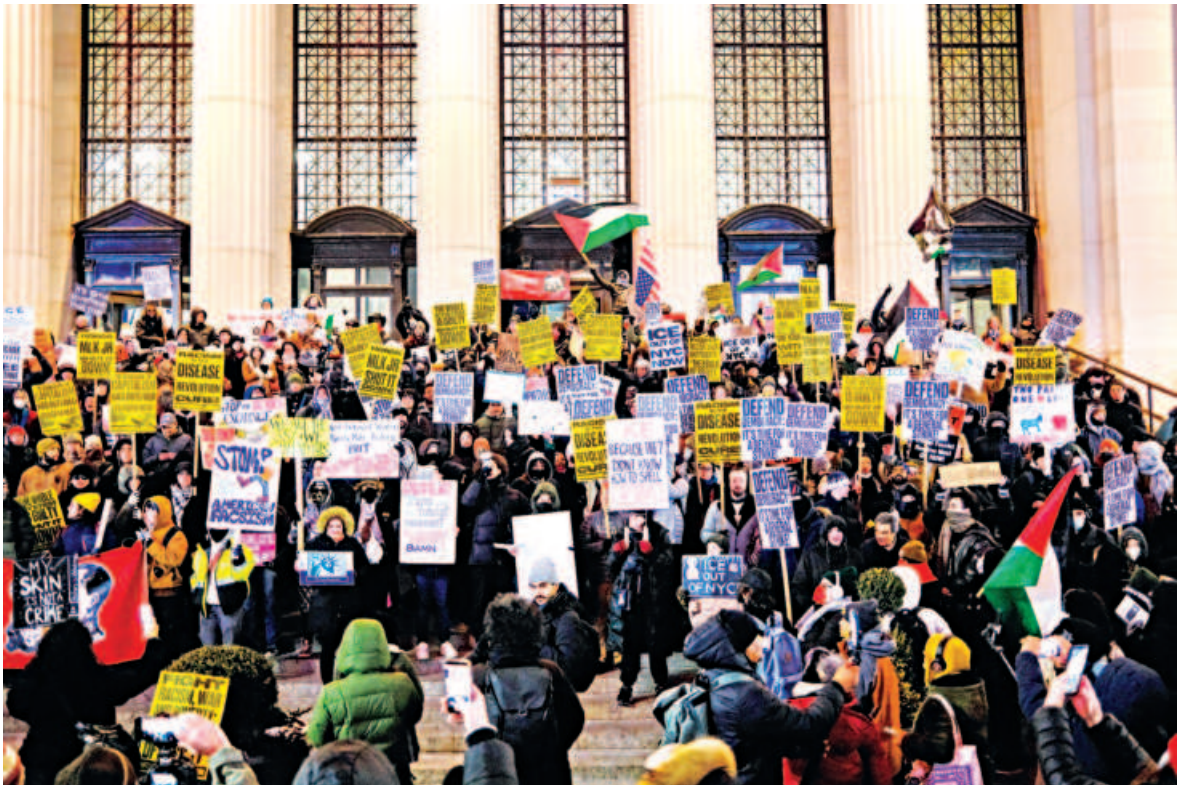
People take part in the nationwide “Stop ICE Terror” rally in New York, US on Tuesday evening, protesting US President Donald Trump’s immigration policies.

and the Pentagon to prepare a range of military scenarios for the president, including options that could seek to remove Iran's leadership, reports Anadolu Ajansi online. The officials were quoted as saying that Trump has not authorised strikes and that his final decision remains uncertain, but the ongoing discussions indicate he has not ruled out taking action against Tehran over the killing of protesters. Iran has been rocked by nationwide protests since late December over economic hardship and the sharp depreciation of the rial, with demonstrations spreading from Tehran to several cities. According to the US-based Human Rights Activists News Agency (HRANA) on Monday, at least 4,029 people have been killed, more than 26,000 arrested and over 5,800 injured during the unrest. Iranian officials have accused the US and Israel of backing what they described as "armed rioters." Trump has repeatedly threatened to "hit hard" if protesters were killed but later commended Tehran for reportedly cancelling hundreds of scheduled executions.