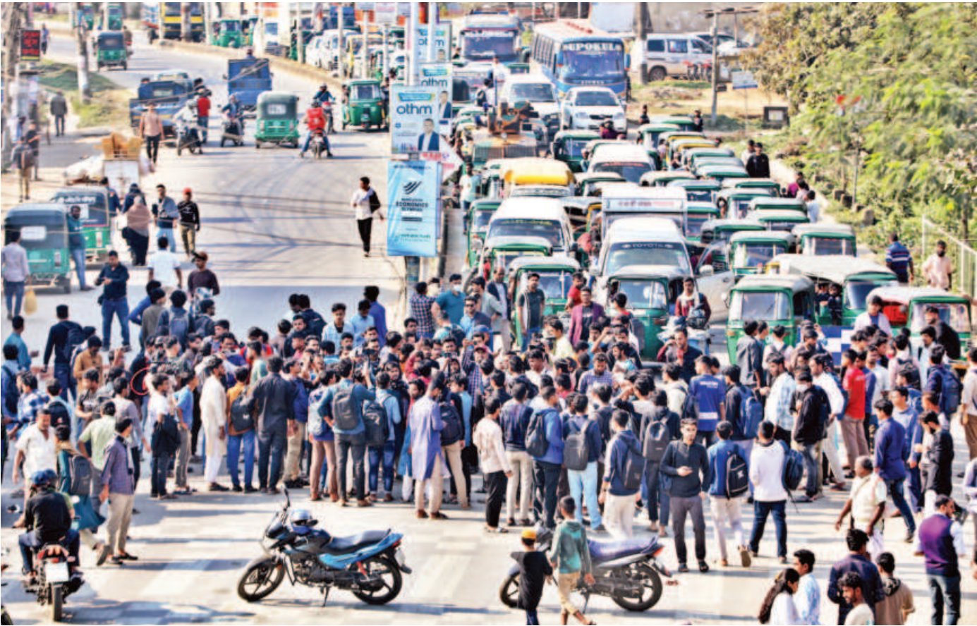
Students of Shahjalal University of Science and Technology block the Sylhet-Sunamganj highway yesterday afternoon as part of their demonstrations against a High Court order that suspended the Sucsu and hall union polls slated for today.