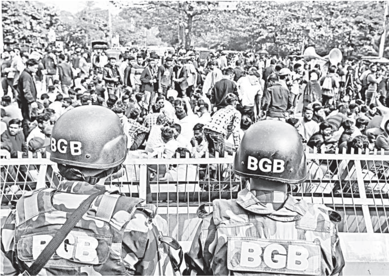
Leaders and activists of Jatiyatatabadi Chhatra Dal continued their sit-in outside the Election Commission headquarters in Agargaon yesterday, protesting the EC's "biased and controversial" role ahead of the national election slated for February 12. They eventually postponed the agitation in the evening after meeting the EC, which assured them it would look into their demands.