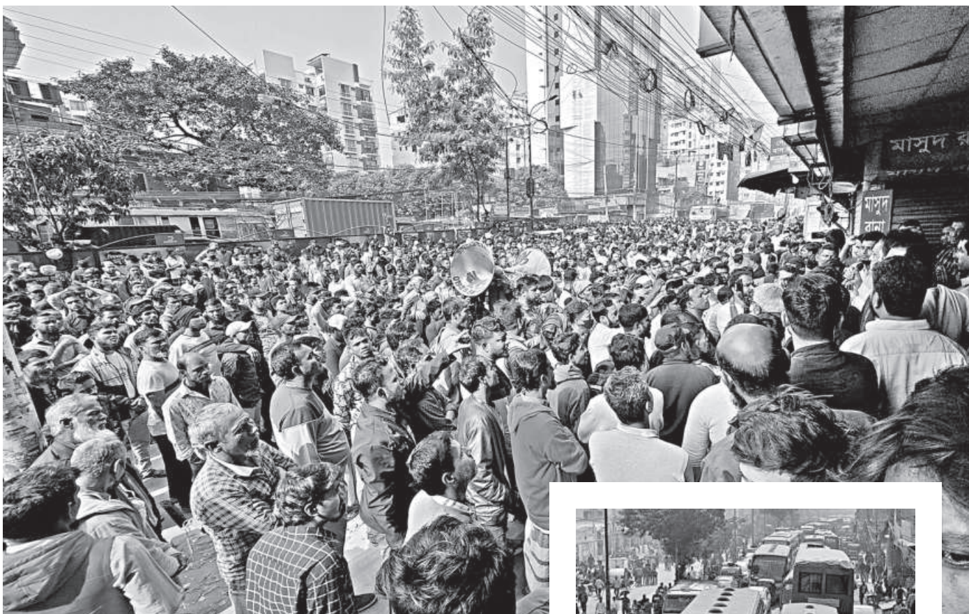
Battery-run auto-rickshaw owners and drivers block Rampura Road in Uttar Badda around 10:00am yesterday, demanding unhindered operation in the capital. The blockade continued till afternoon, causing severe gridlocks in the surrounding areas, inset.

The rally and gathering were organised yesterday to protest alleged death threats against the Jamaat-nominated candidate for the Kushtia-3 (Sadar) constituency, Amir Hamza.