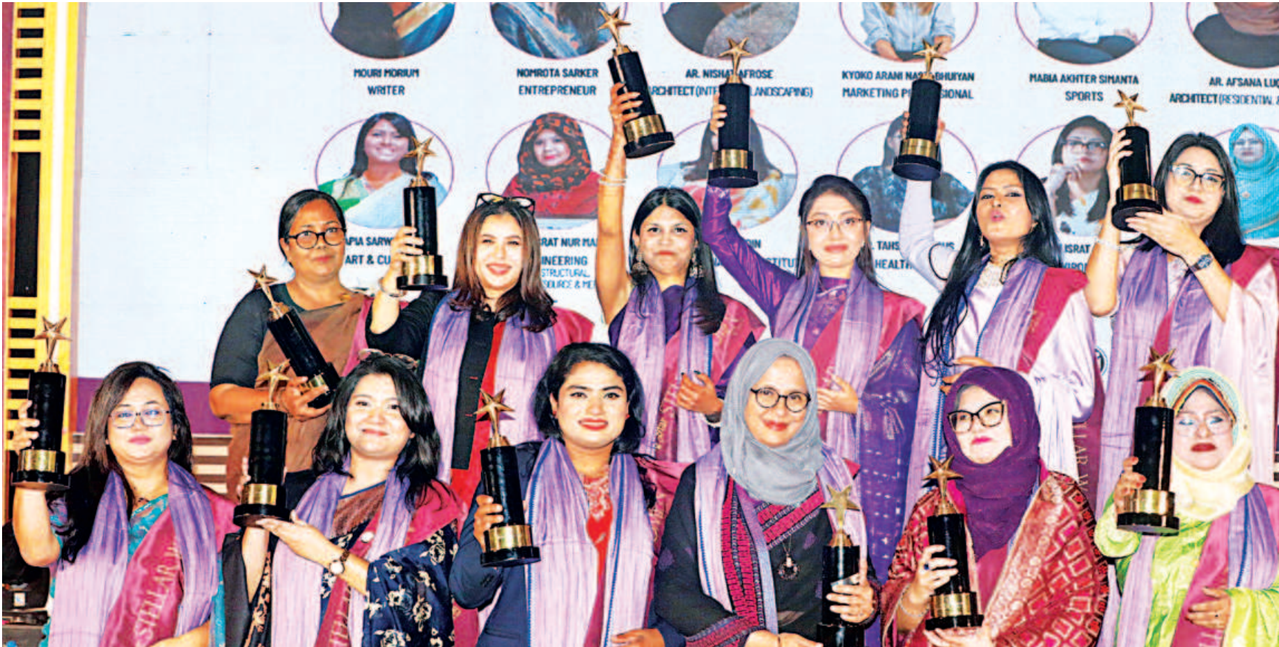
Winners of “bti The Daily Star Stellar Women 2025” posed for a photo at the Banquet Hall of the Kurmitola Golf Club.