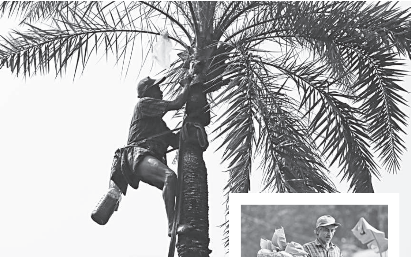
A sap collector climbs a date palm tree in the Duhorpara area of Barishal's Uzirpur upazila early yesterday to collect date palm sap. After collecting the sap, he pours it into containers wrapped with banana leaves and sells it at local markets, inset. He makes around Tk 1,200 a day.