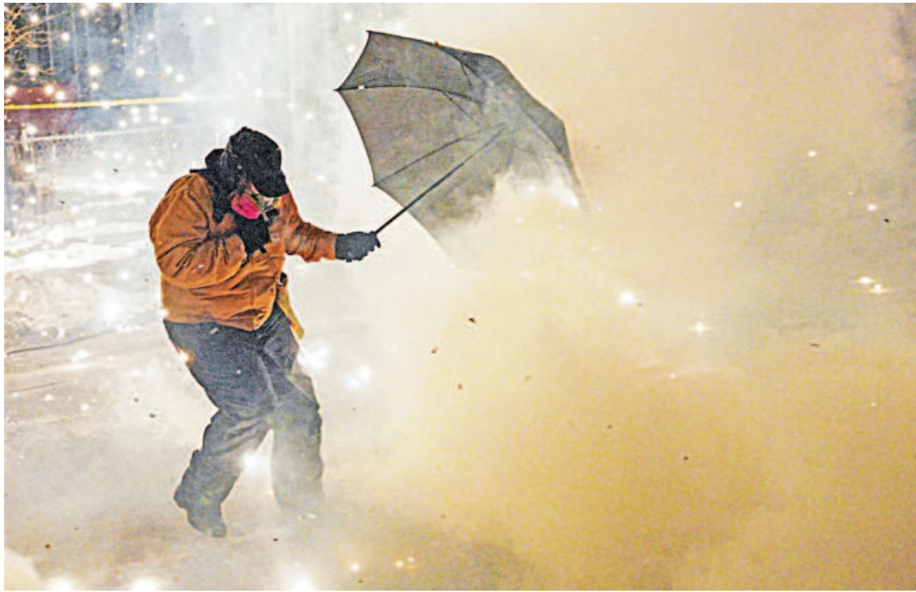
A protester shields themselves as federal agents fire munitions in Minneapolis, Minnesota, US on Wednesday, amid rising tensions after a federal agent fatally shot a woman last week. President Trump has threatened to deploy the military as unrest roils Minnesota.