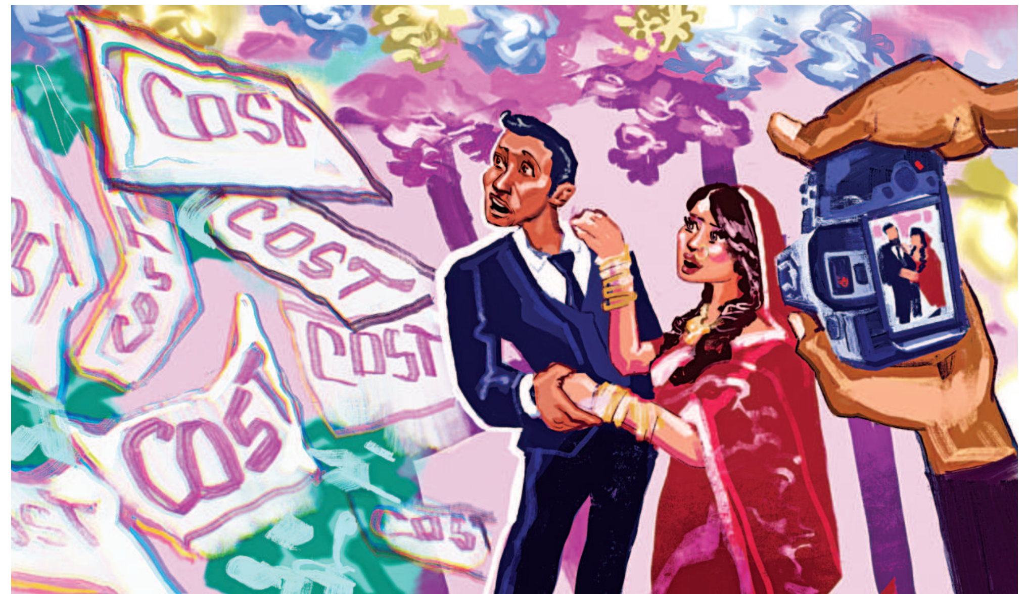
ILLUSTRATION: MONG SHONIE