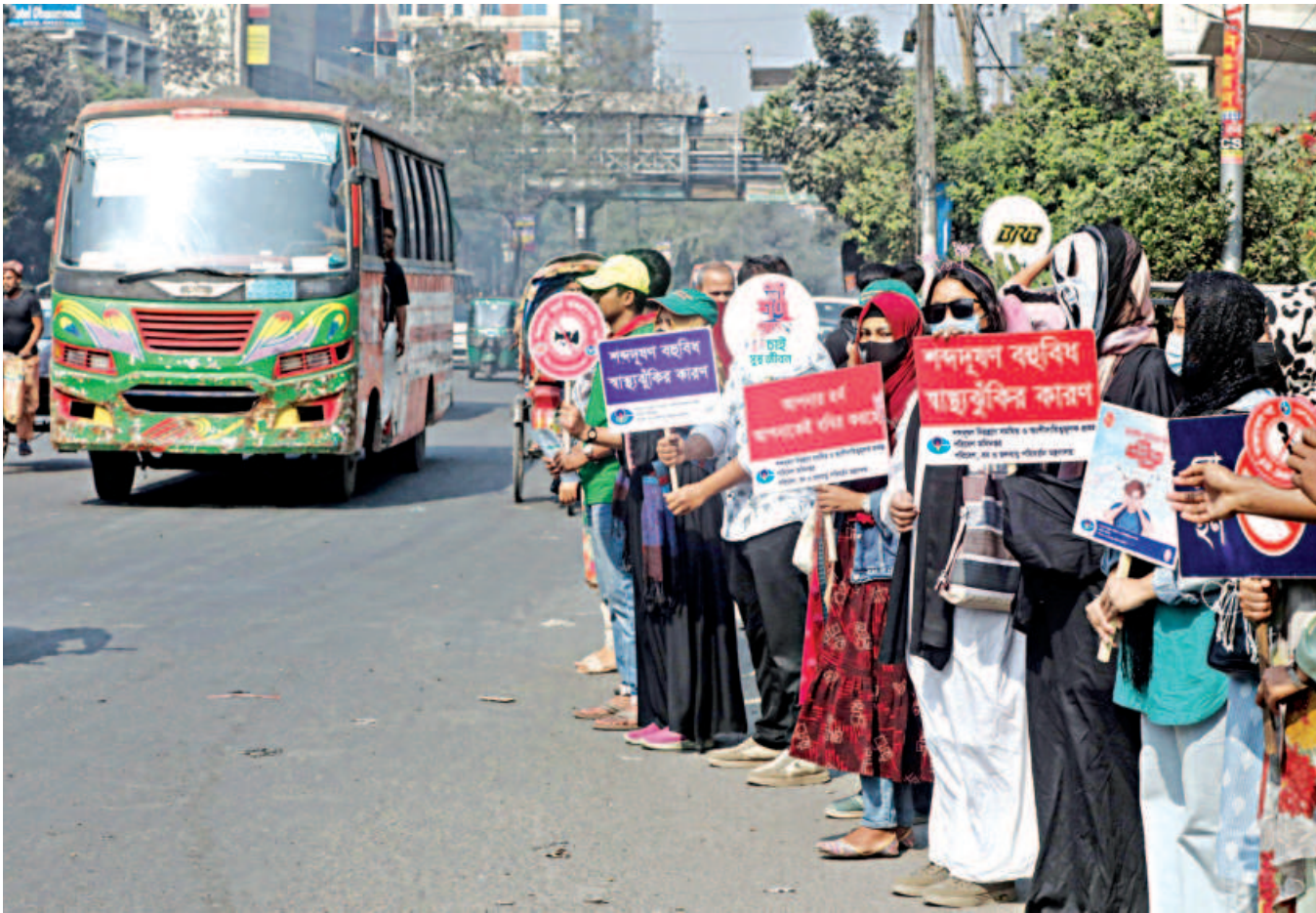
Holding banners and placards to raise awareness about noise pollution, a group of people stood at the Science Lab intersection in Dhaka yesterday as part of the environment ministry's 10-day campaign across the capital.

STAFF CORRESPONDENT The youth wing of the Consumers Association of Bangladesh (CAB) has demanded that political parties and candidates contesting the upcoming national election include the cancellation of the power purchase agreement with Indian company Adani Power in their election manifestos. They also placed 12 other demands on power and energy issues at a press conference at the auditorium of Dhaka Reporters' Unity yesterday, calling for commitments from election contestants. The other demands include postponing an increase in imports of liquefied natural gas for at least the next five years; prohibiting any increase in coal-based power generation; transforming the sector into a service-based one from a profit-driven model; reducing imports of fossil fuels by at least 5 percent within the next five years; increasing solar power generation to 15 percent; ensuring 100 percent onshore gas exploration by state-owned BAPEX; cancelling deals with all furnace-oil-based power plants under the Quick Enhancement of Electricity and Energy Supply (Special Provisions) Act, 2010; ensuring compensation from those companies; preparing a roadmap for using the explored gas in Bhola and Chatak; SEE PAGE 9 COL 4