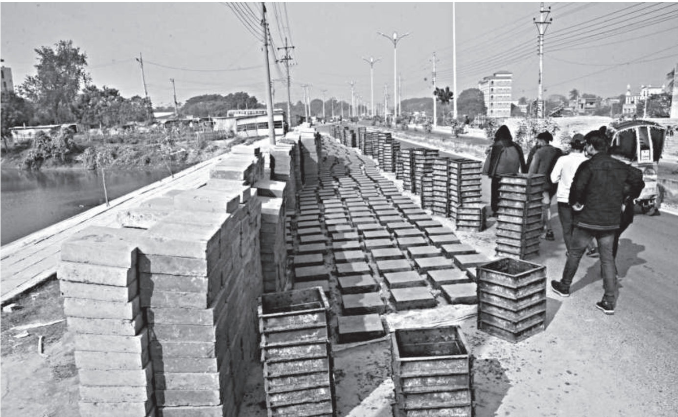
On both sides of a key arterial road connecting Rajshahi and Chapainawabganj, contractor companies have occupied more than half of the carriageway to produce cement blocks, severely disrupting pedestrian and vehicular movement. The work has been ongoing for months due to a lack of proper supervision by the authorities, alleged locals. The photo was taken in the Court Dhalan area recently.

The embassy described the decision as a humanitarian gesture, saying, "This reflects the UAE leadership's commitment to compassion, tolerance, and justice, as well as the deep-rooted, brotherly relations between the United Arab Emirates and the People's Republic of Bangladesh."