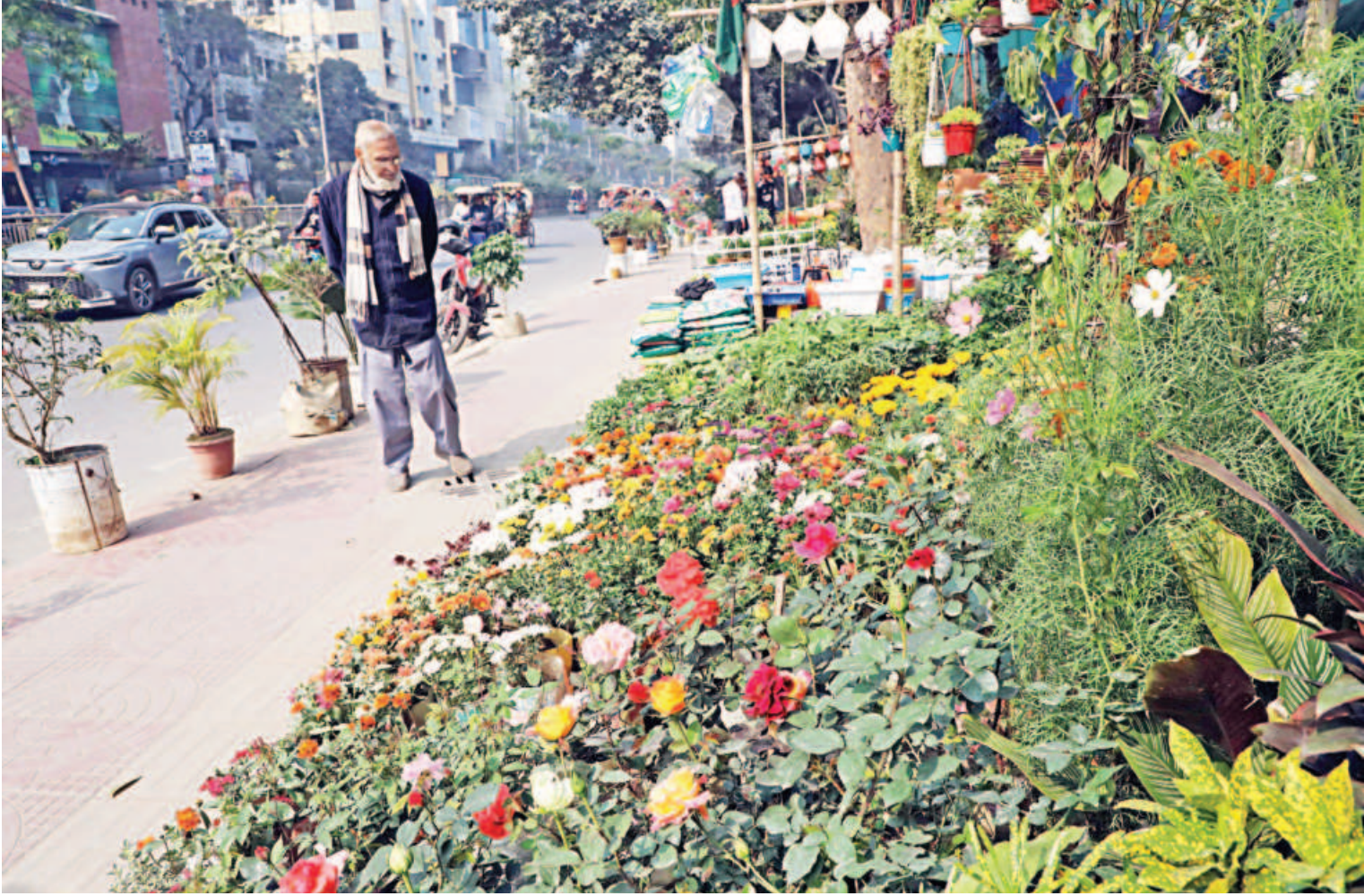
A pedestrian pauses to admire blooming flowers displayed on a footpath beside the Abahani playground in Dhaka's Dhanmondi, where passersby often stop to admire or buy plants for indoor and rooftop decoration. The photo was taken yesterday.