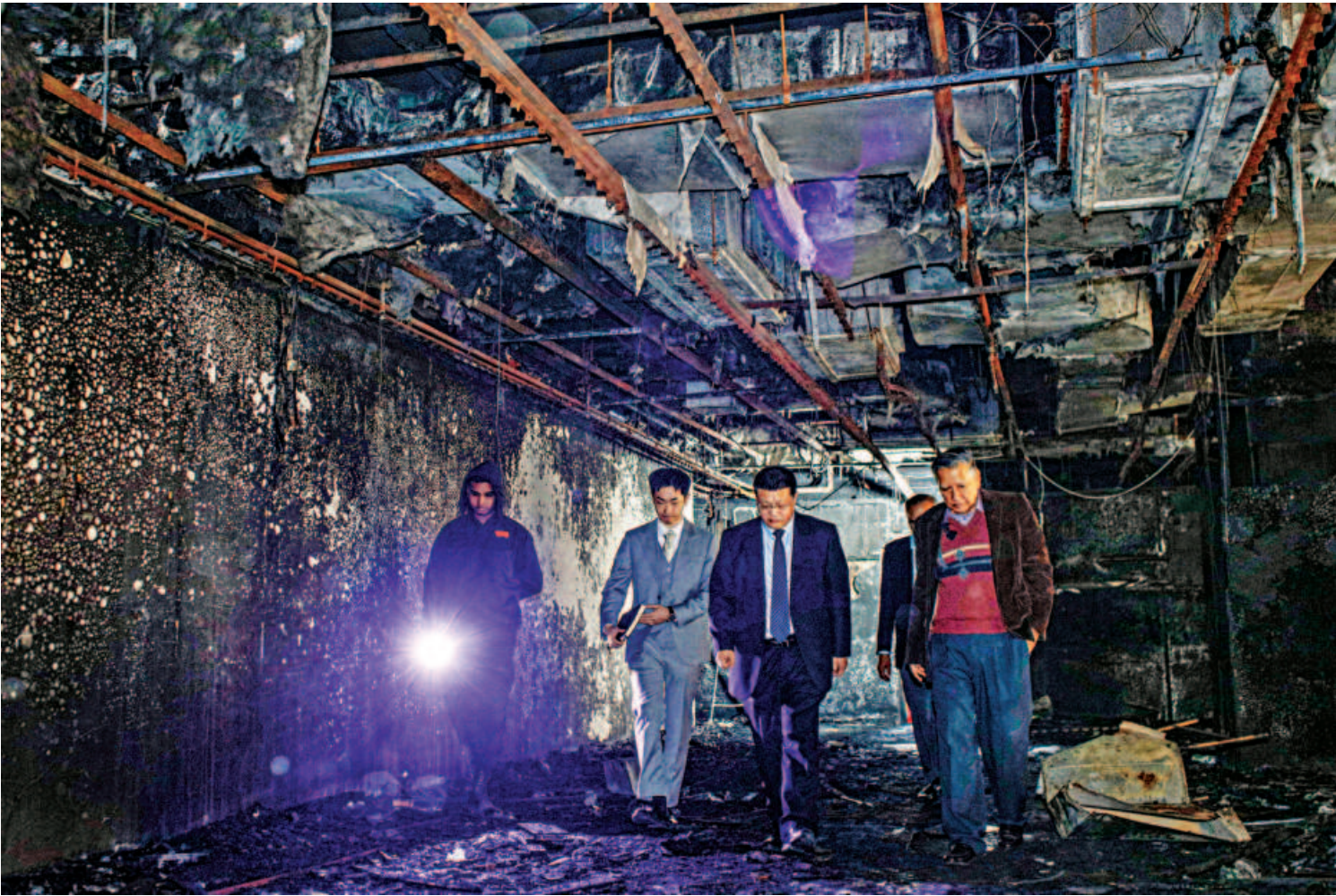
Chinese Ambassador to Bangladesh Yao Wen walks amid charred rubbles at The Daily Star office, which was attacked and torched in the early hours of December 19. During his visit yesterday, the envoy strongly condemned the attack.

Chinese Ambassador to Bangladesh Yao Wen has strongly condemned the recent attacks, vandalism and arson at the office of The Daily Star in Dhaka, expressing solidarity with the newspaper and support for independent media. He made the remarks during a visit to The Daily Star building yesterday, which was vandalised, looted and set on fire in the early hours of December 19. He described the attacks as unacceptable and emphasised that violence against media institutions undermines freedom of expression and the rule of law. Yao Wen said China firmly supports the role of independent media in a democratic society, and lauded The Daily Star's stance on democracy, freedom of speech and human rights. He also stressed the importance of ensuring the safety of journalists and media organisations so they can carry out their professional duties without fear or intimidation.