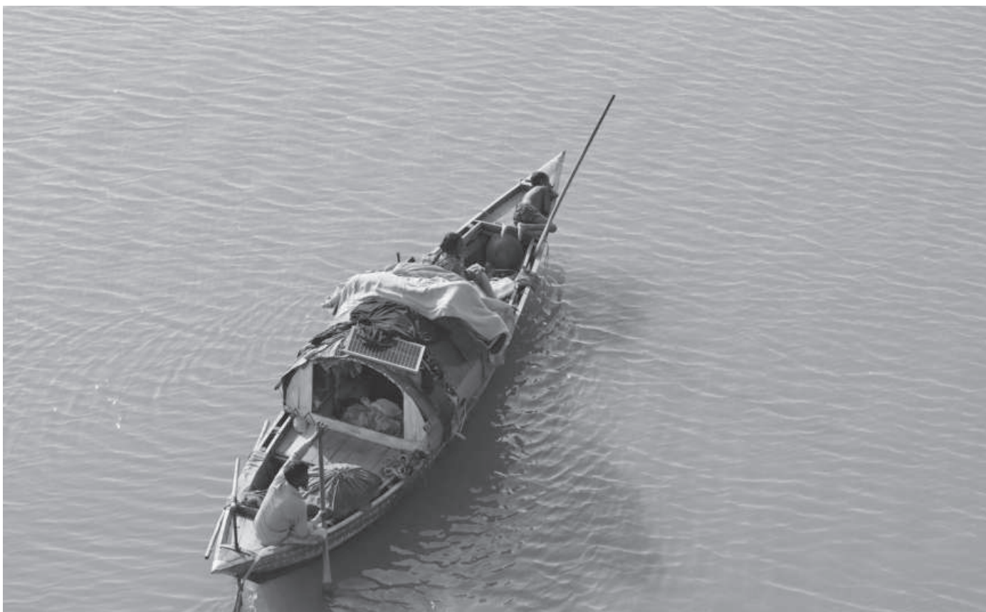
After fishing, a family of the Manta community heads towards their destination by boat along the Tulatti River in Bakerganj upazila of Barishal yesterday.

According to police and co-workers, he accidentally came into contact with a live electric wire and was critically injured.