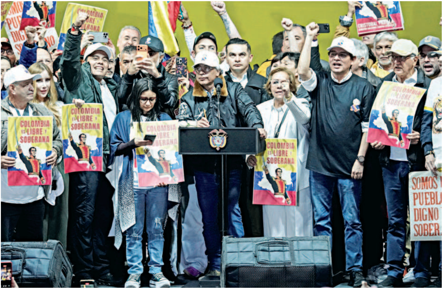
Colombian President Gustavo Petro attends a rally in Bogotá on Wednesday, defending national sovereignty after US President Donald Trump suggested possible military intervention in Colombia, days after the US struck Venezuela and captured President Nicolás Maduro and his wife, Cilia Flores.

REUTERS, Moscow Russia said yesterday that any troops sent to Ukraine by Western governments would be “legitimate combat targets”, after Britain and France announced plans to deploy a multinational force there in the event of a ceasefire. A Russian Foreign Ministry statement said “militaristic declarations” by a coalition of pro-Ukraine Western governments were becoming increasingly dangerous. Russia was responding for the first time to a meeting of the “coalition of the willing” in Paris on Tuesday at which Britain and France signed a declaration of intent on the future deployment. British Prime Minister Keir Starmer said it paved the way for a legal framework whereby “British, French and partner forces could operate on Ukrainian soil.”