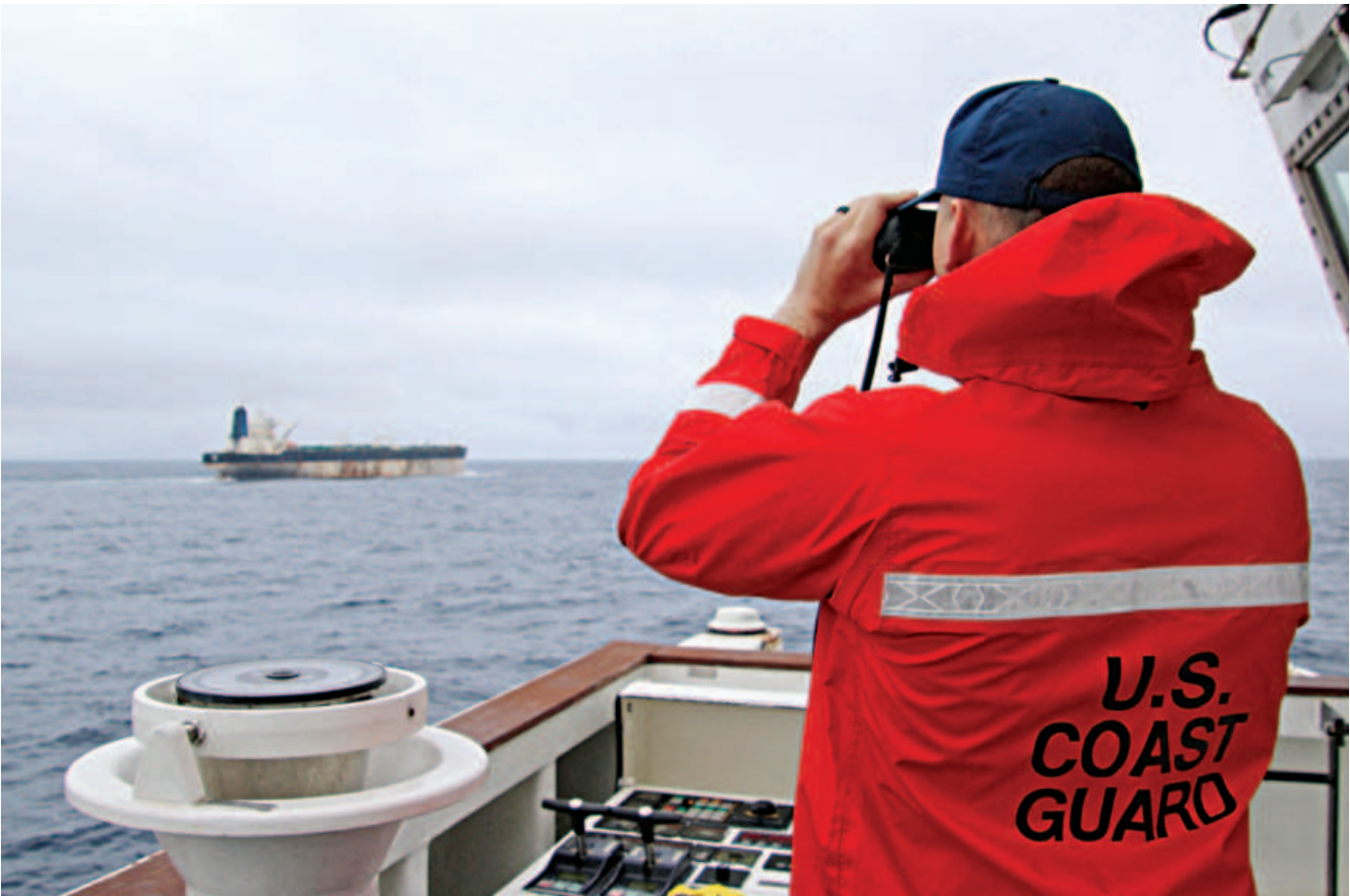
This undated handout photo released yesterday by the US European Command's X account shows the M/V Bella 1 oil tanker in the northern Atlantic Ocean. The US military yesterday seized the Russian-flagged oil tanker in the North Atlantic for sanctions violations, bringing an end to a multi-week pursuit by American forces.