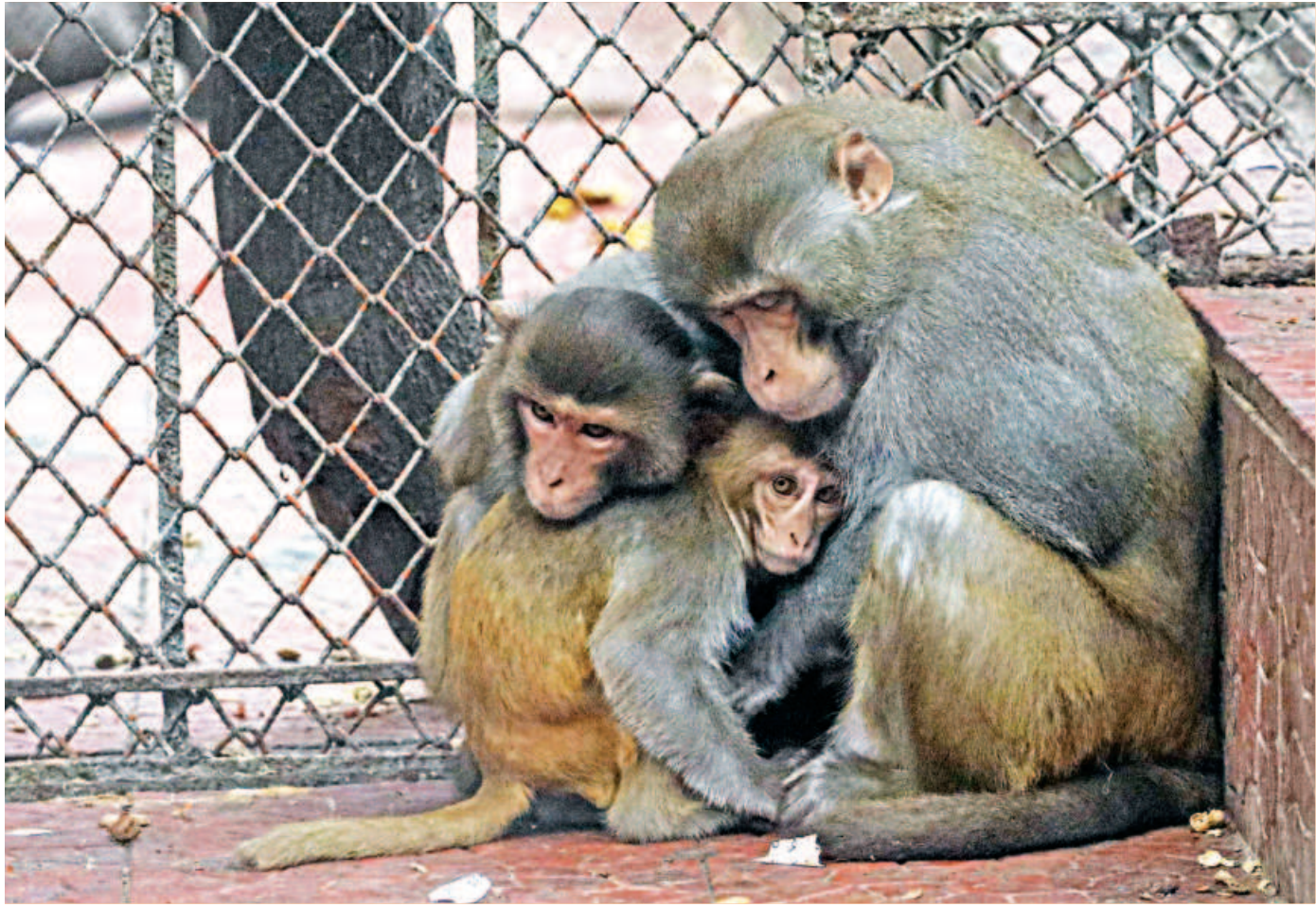
WARMTH OF LOVE ... A family of rhesus monkeys at the Chattogram Zoo huddle together to keep warm yesterday as a cold wave sweeps over the country. Like humans, animals too seek warmth in togetherness.