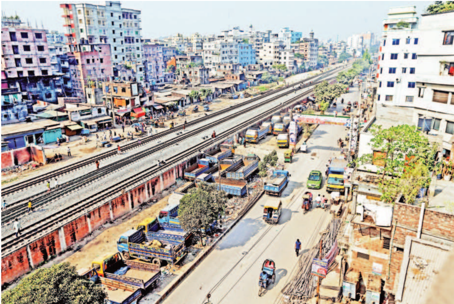
The Dayaganj-Jurain Road has been in a neglected state for a long time after Bangladesh Railway built a boundary wall along the rail line, significantly narrowing the road. Due to reduced width and severe deterioration, the road has become a struggle for commuters.