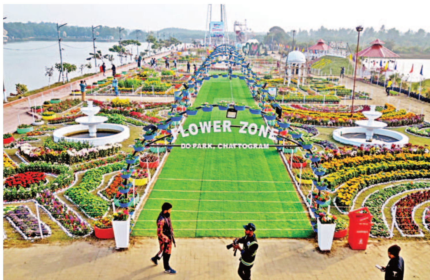
A month-long flower festival is set to begin at DC Park in Faujdarhat of Chattogram, where the park has been adorned with vibrant decorations and 140 species of local and foreign flowers. The festival will be open to visitors daily from 10:00am to 8:00pm between January 9 and February 8. The photo was taken recently.