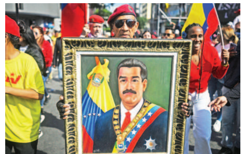
A man holds a picture of ousted Venezuelan President Nicolas Maduro during a rally in support of Maduro and his wife, Cilia Flores, in Caracas, yesterday.