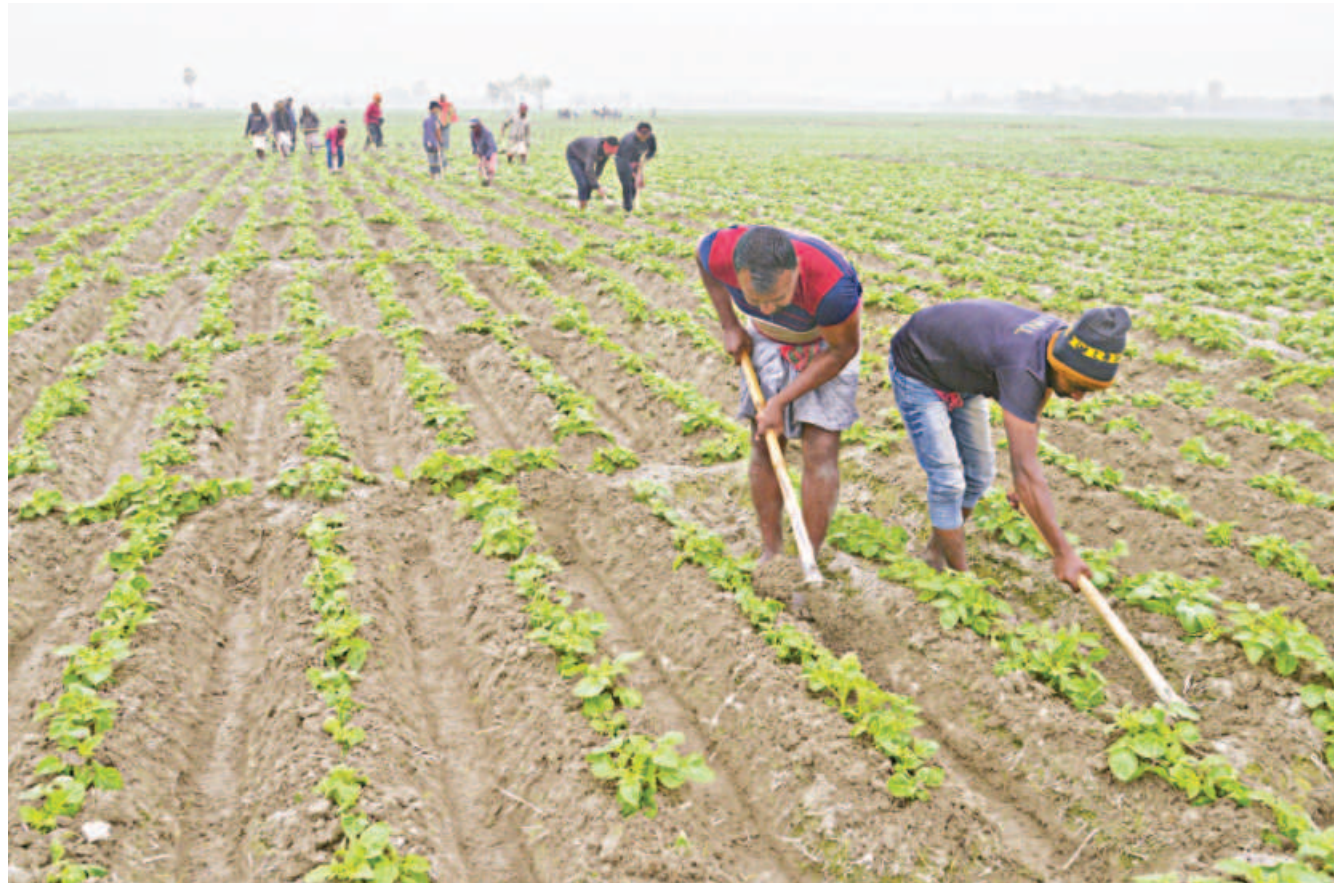
With winter well underway, farmers of Kaliganj village in Rajshahi's Tanor upazila brave the biting cold to tend to their potato fields, as the season is ideal for tuber cultivation. Rajshahi yesterday recorded the lowest temperature in the country so far this winter at 7 degrees Celsius.