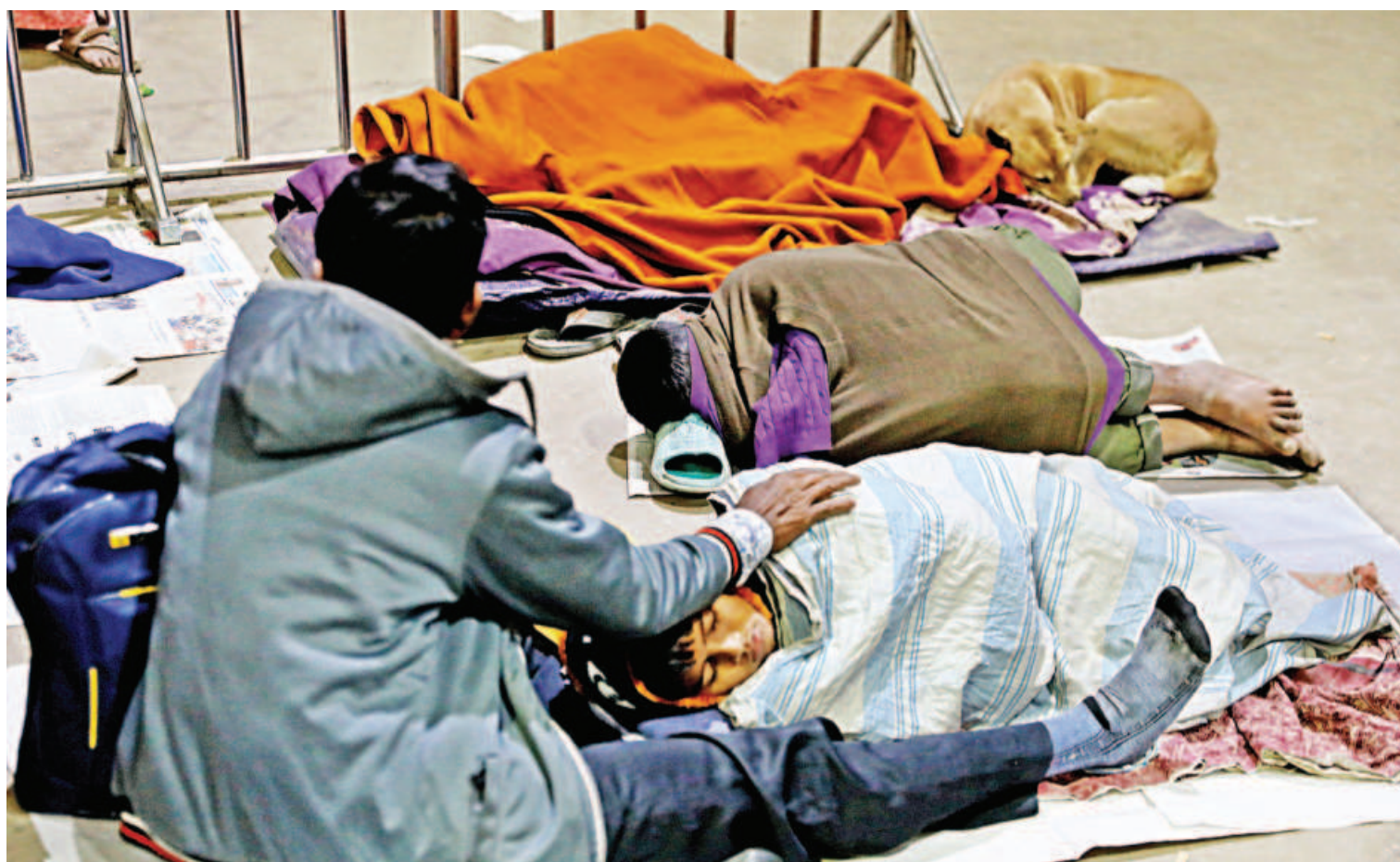
A passenger sits by the homeless people taking shelter on the platform of Kamalapur Railway Station, wrapping themselves in whatever clothing they can find to fend off the cold. A dog curled up nearby, seeking the warmth of human presence. The photo was taken around 2:00am yesterday, when the temperature in the capital dropped to around 14 degrees Celsius.