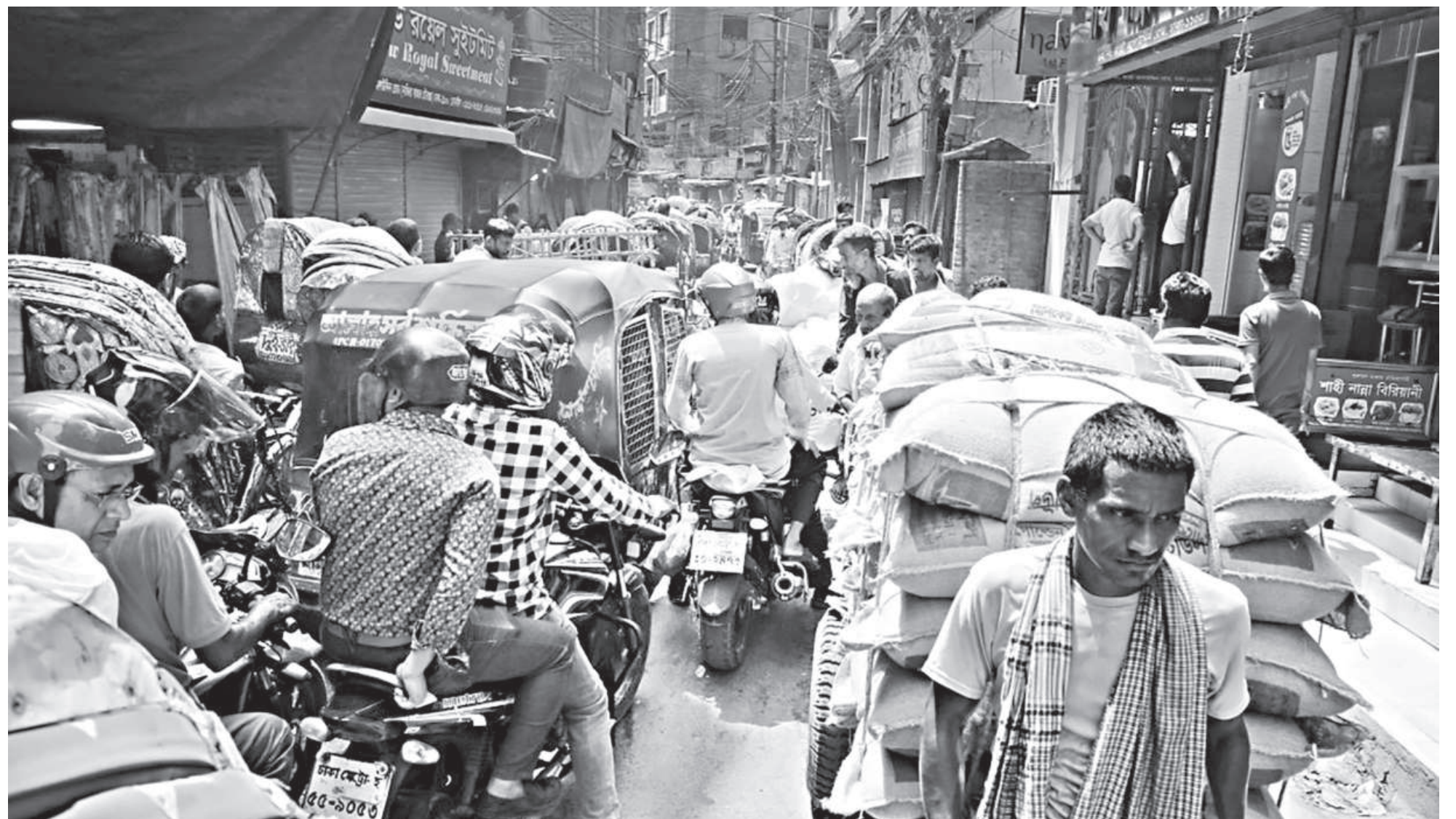
Walking for 15 minutes in any neighbourhood of Dhaka either feels unsafe, unpleasant, or physically exhausting for even people in good health.

The 15-minute city concept is simply about putting human needs at the centre of urban growth. It doesn't mean one cannot travel far when needed; rather, it means one shouldn't be forced to travel far for basic needs. Also, the way to reach these basic facilities should be accessible and comfortable for all groups of people. The model rests on four pillars: proximity, diversity and mixed land use, density, and ubiquity. Proximity, in terms of mobility, means that essential services should be close enough that people don't lose time in traffic just to buy groceries or see a doctor. It is measured by how far or fast people can travel easily without depending on a motorised vehicle. The diversity of land use