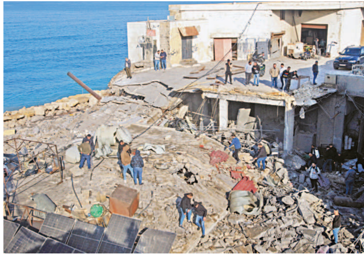
People gather at the site of a building destroyed by an Israeli strike in the industrial area of Ghazieh, near the coastal city of Sidon in southern Lebanon, on Monday.

Fars said parts of the bazaar, including the gold market, had been closed from noon in a "protest against rising foreign exchange rates and price instability".