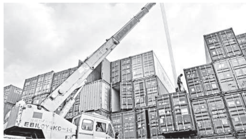
Bangladesh's logistics sector continues to suffer from fragmented decision-making that delays reform and inflates costs. Coherent oversight is long overdue.

The recent tariff disputes, record-high container volumes, persistent congestion, and slow ICD expansion all point to the same conclusion: Bangladesh's logistics challenges are structural, not incidental. Continuing with outdated practices will only prolong inefficiencies and erode competitiveness. Embracing comprehensive reform offers a clear path forward. If Bangladesh is serious about sustaining its growth and competing in an increasingly demanding global market, the time to act is now.