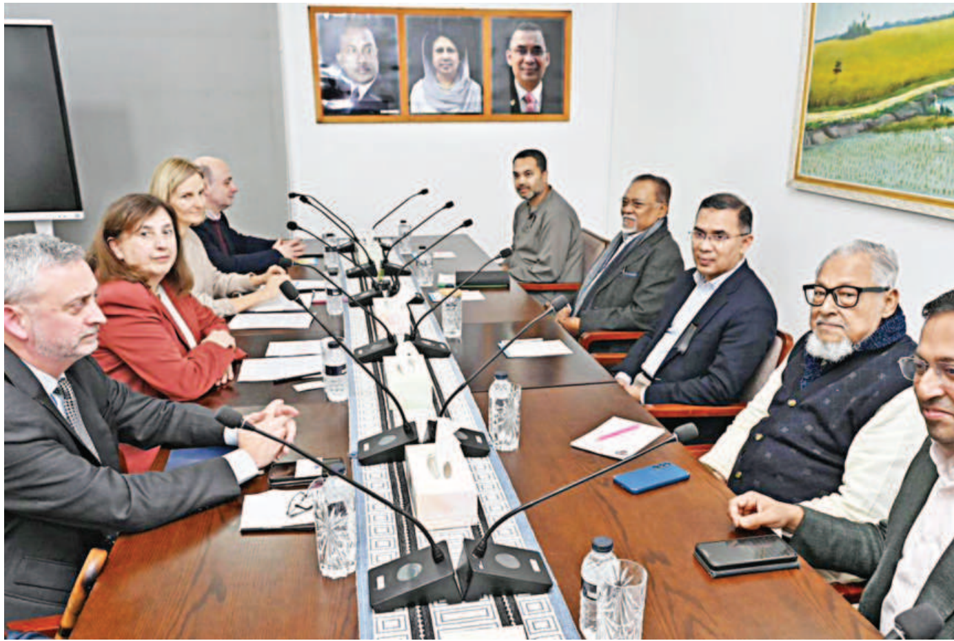
A delegation led by EU Ambassador Michael Miller at a meeting with BNP acting chairman Tarique Rahman at the party chairperson's Gulshan office yesterday evening.