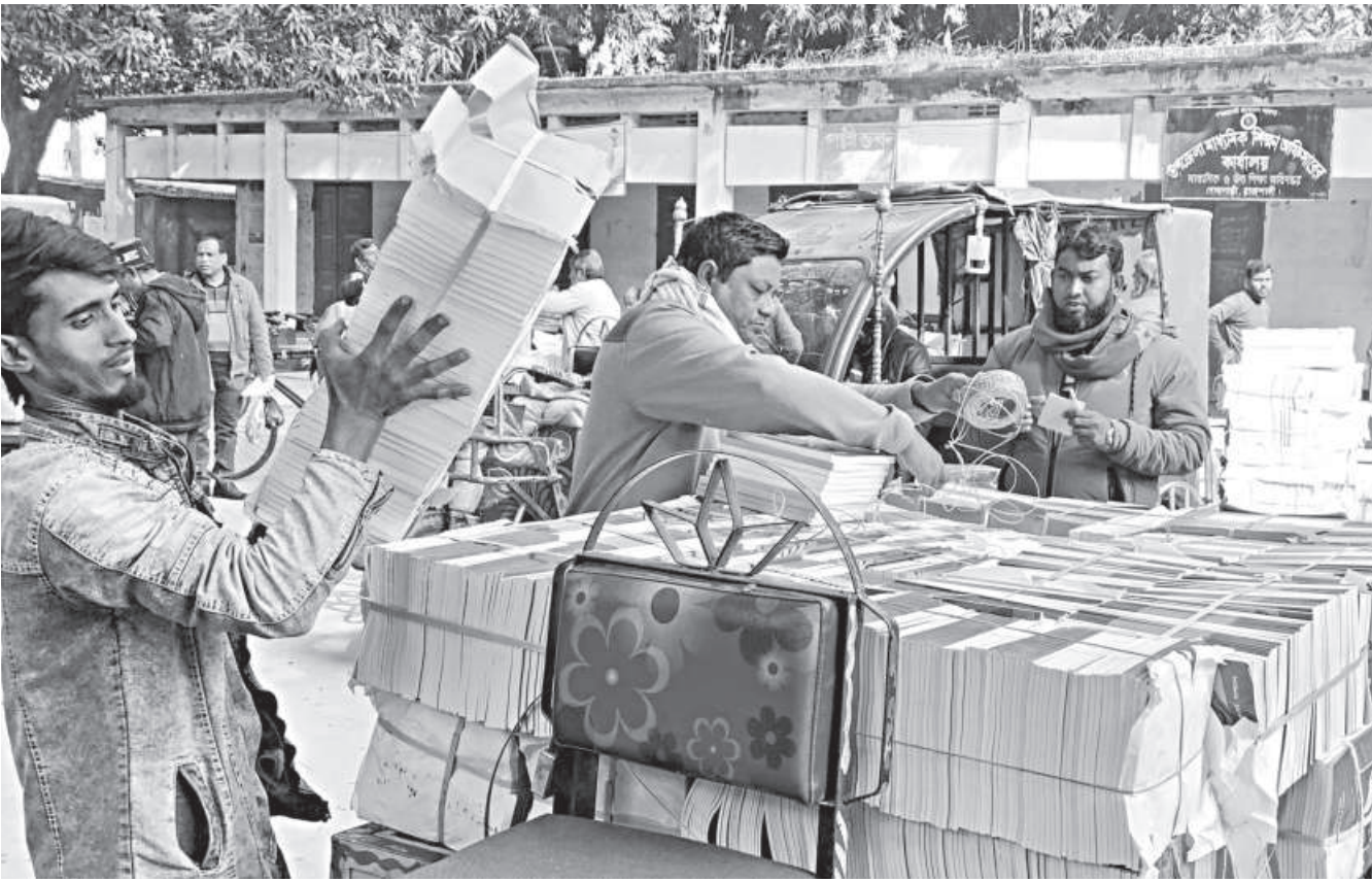
The teachers concerned collect newly printed secondary-level textbooks from the Upazila Education Office in Godagari, Rajshahi for distribution to their respective schools, ahead of the January 1 nationwide textbook distribution for class I-IX students. The photo was taken recently.