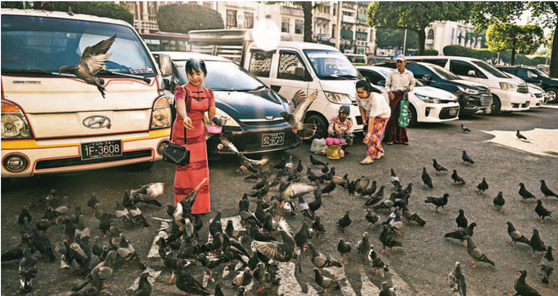
People feed pigeons on a street in Yangon yesterday, a day before the start of Myanmar's general election. The election will be held in phases and expected to last a month. Myanmar has been hammered by a civil war triggered by a 2021 coup in which the military ousted an elected civilian government led by Aung San Suu Kyi. Suu Kyi remains jailed, her hugely popular party dissolved and the poll is being widely criticised by democracy watchdogs as an exercise to rebrand military rule.