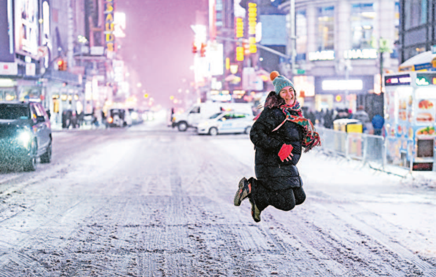
A woman jumps in the air in Times Square as snow falls during a winter storm in New York City. A winter storm packing a frosty mix of snow and ice bore down on the US Northeast Saturday, disrupting post-holiday weekend airline traffic and prompting officials in New York and New Jersey to issue weather emergency declarations.