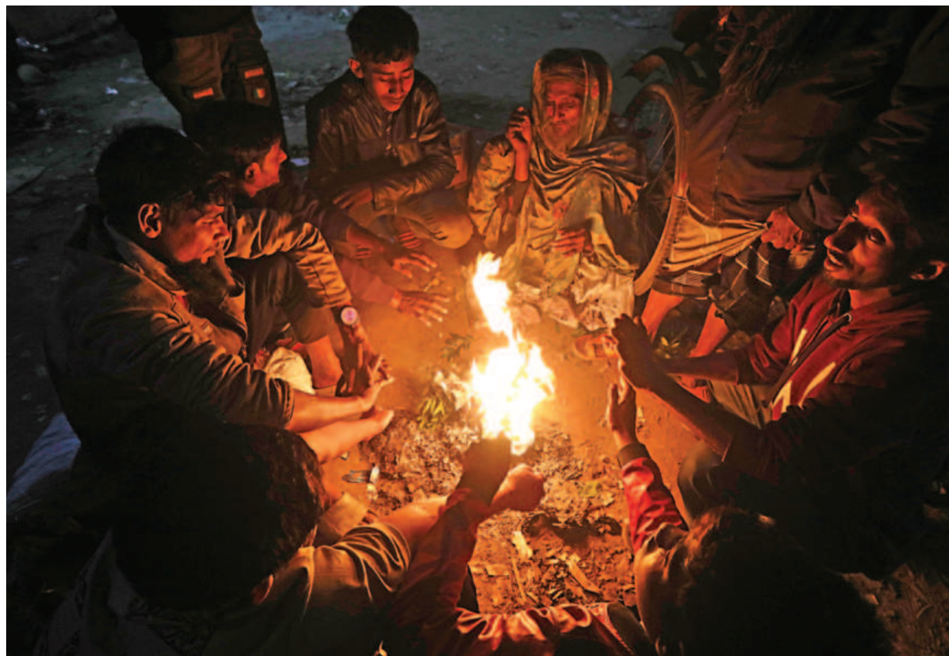
A group of men gather around a makeshift campfire for warmth amid the biting cold weather. The photo was taken on Indira Road in the capital last night.

Another commissioner, Anwarul SEE PAGE 3 COL 7