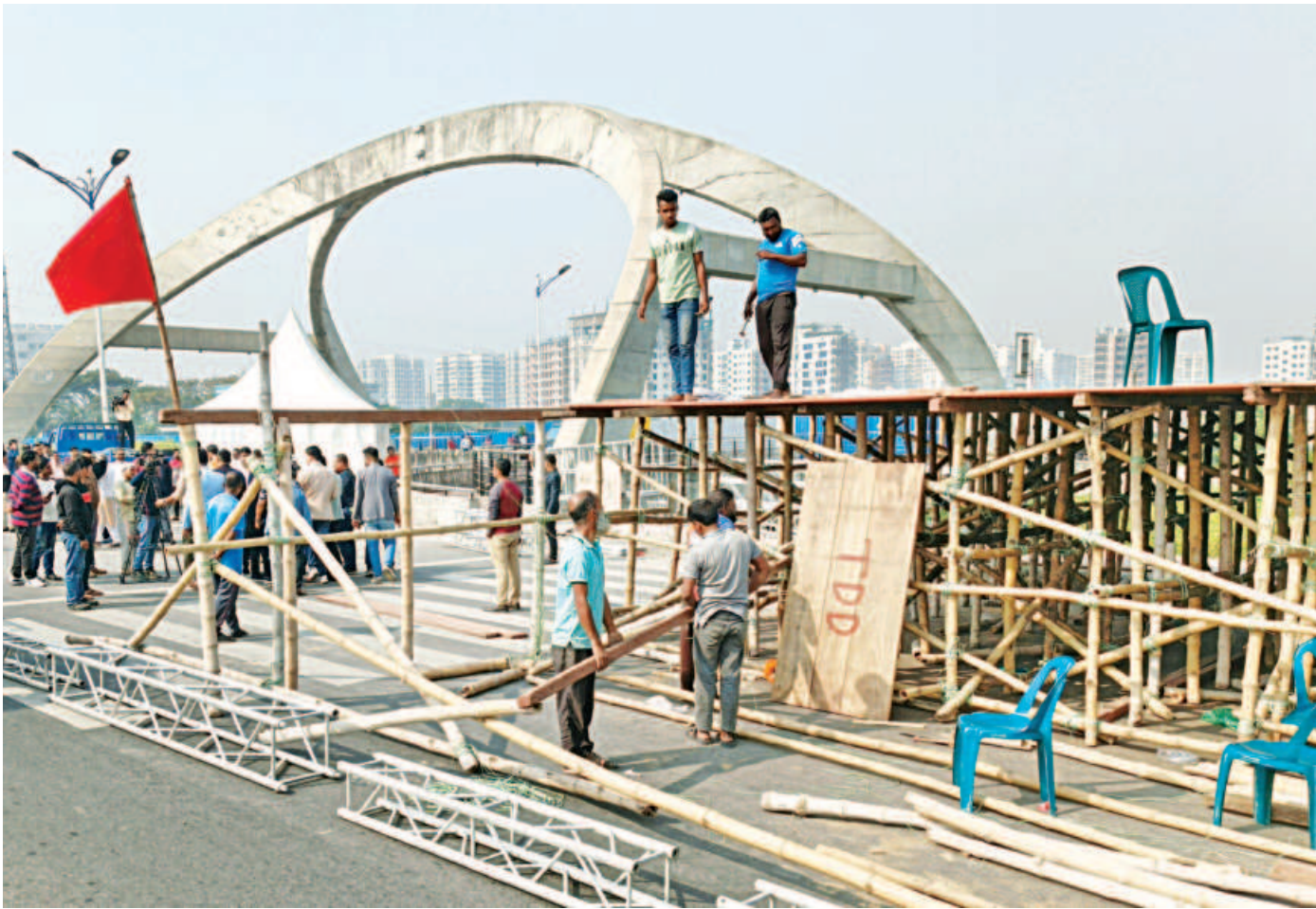
Workers preparing a stage in the capital’s 300 Feet area to hold a reception for BNP acting chairman Tarique Rahman. He is expected to address party leaders, activists, and supporters.