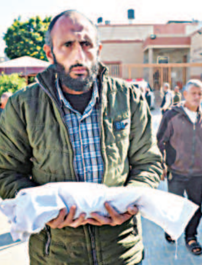
Essential drug shortage hits 321 items, a 52pc gap

Shortage of lab, blood supplies hits 59pc